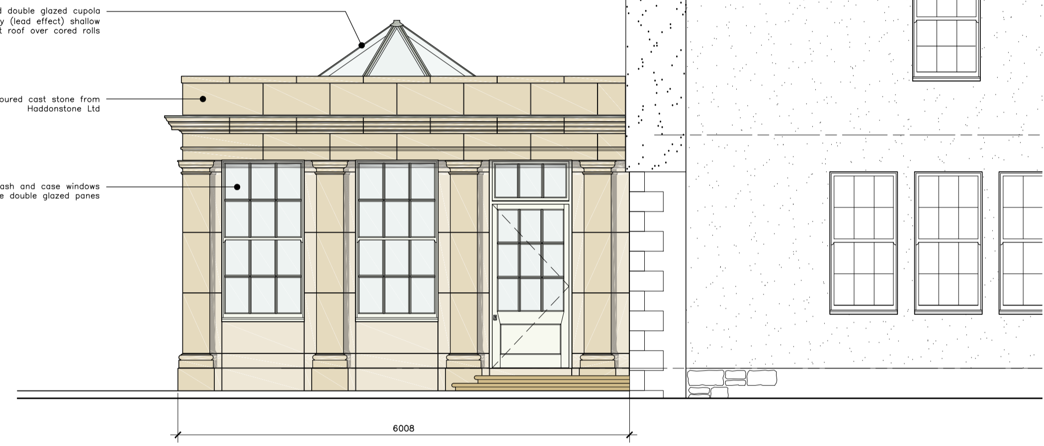
PROPOSED PART EAST ELEVATION (1:50)