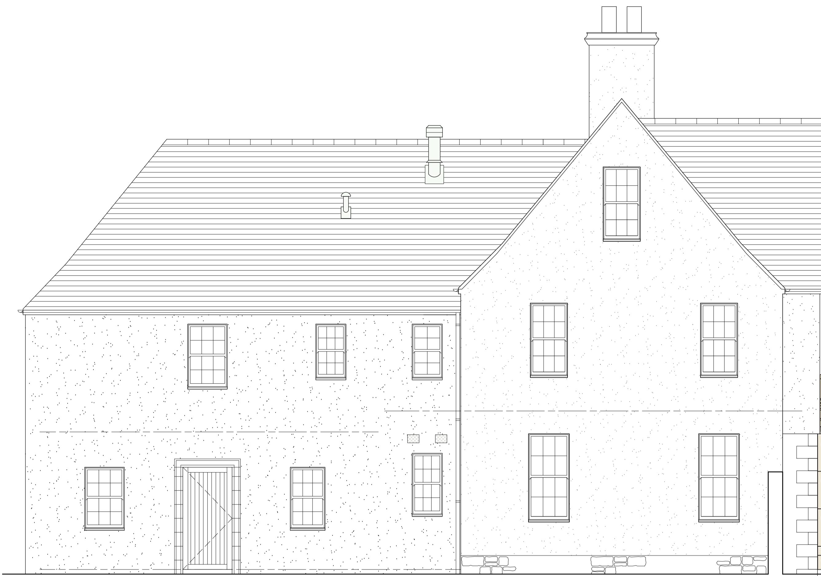
PROPOSED WEST ELEVATION (1:50)