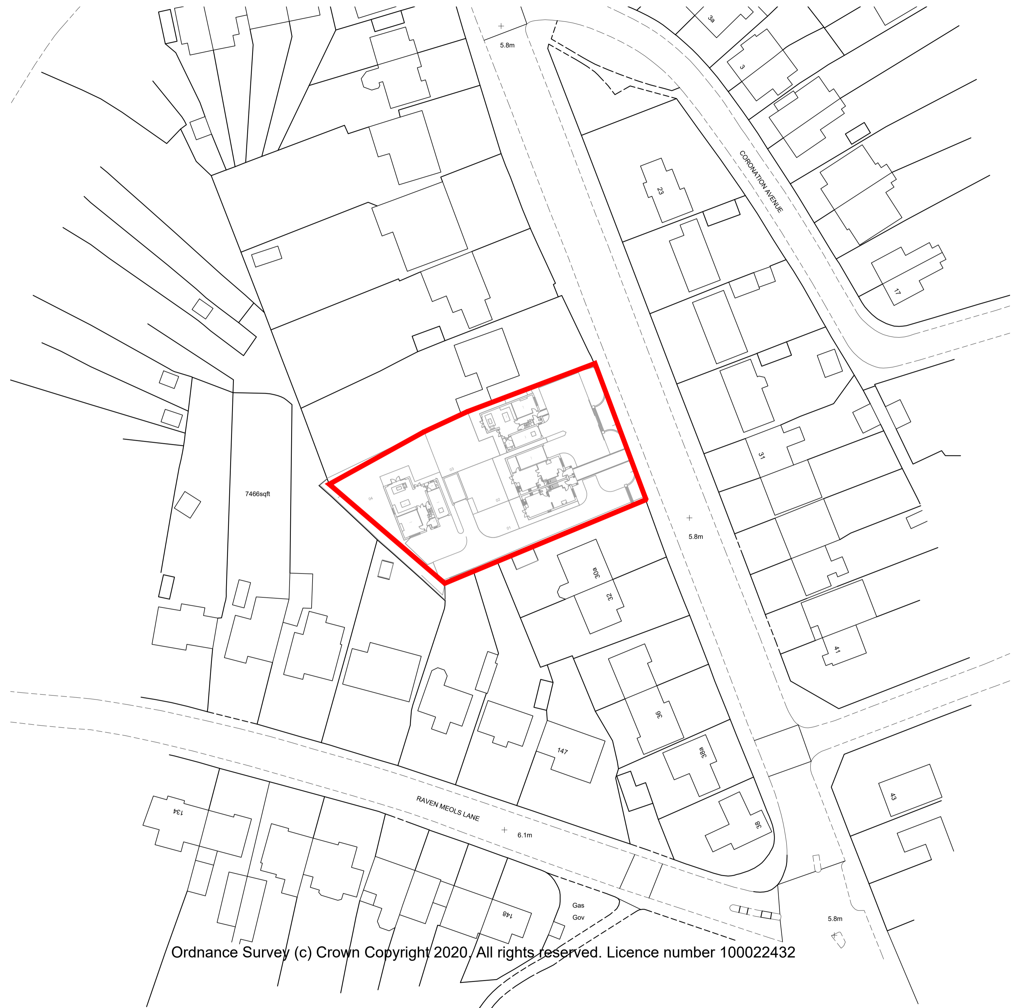
BLOCK PLAN 1 : 500 SCALE

The content of this drawing is subject to the provision of the Copyright Act 1956. Work to figured dimensions only. Site dimensions are to be checked before work is started. Any discrepancy whatsoever between any information contained on this drawing and any other document or drawing must be drawn to the attention of the Architect by the contractor before the work is executed. IF IN DOUBT ASK IMMEDIATELY.