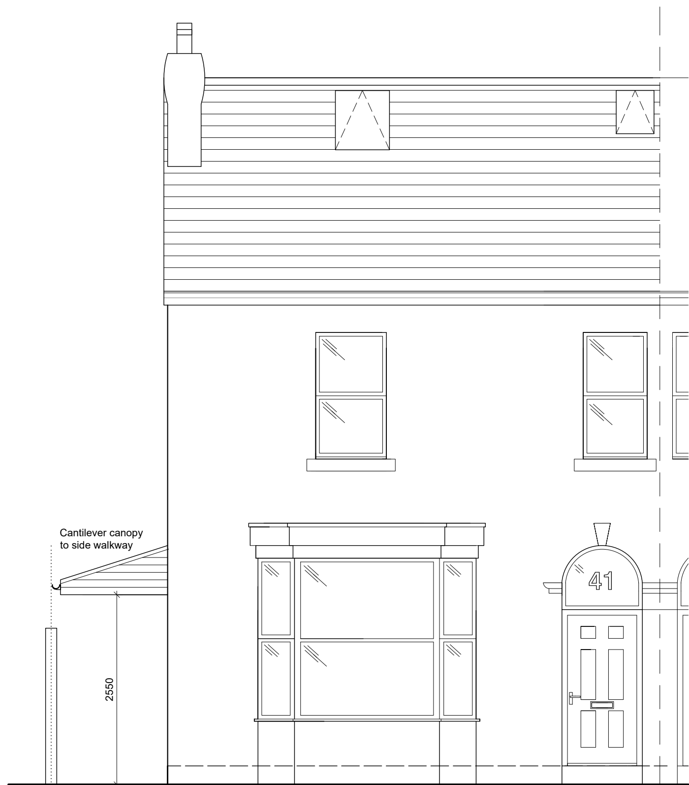
FRONT ELEVATION (NORTH)

1. All dimensions to be checked on site prior to commencement. 2. Do not scale measurements from drawing.