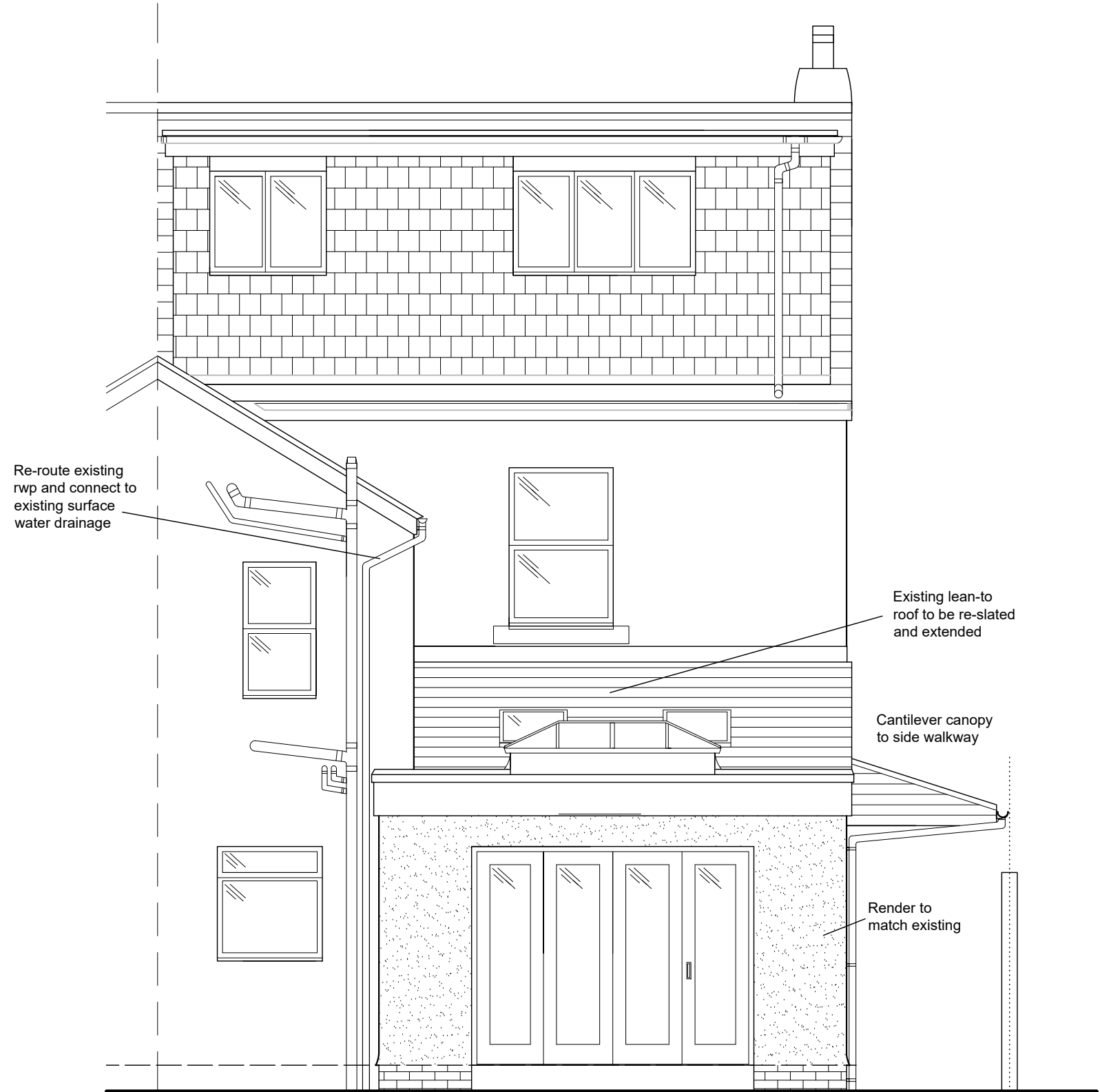
REAR ELEVATION (SOUTH)