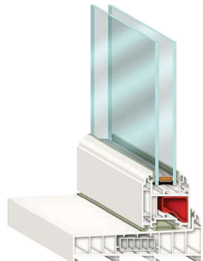
Vertical Sliding Sash Window