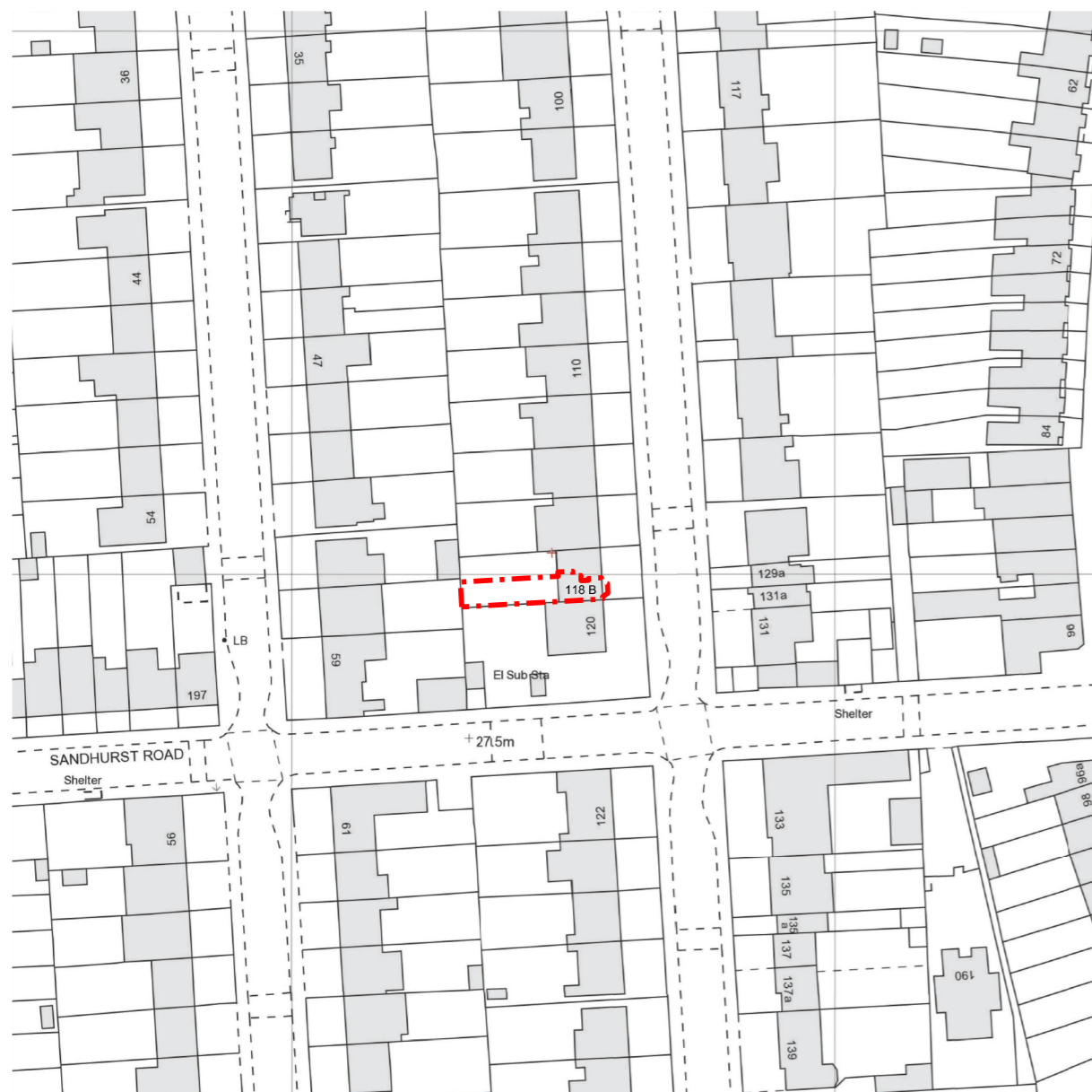
01 LOCATION PLAN SCALE 1:1250

Contractors are to check all dimensions prior to commencement on site and notify the architect of any errors, omissions, or discrepancies.