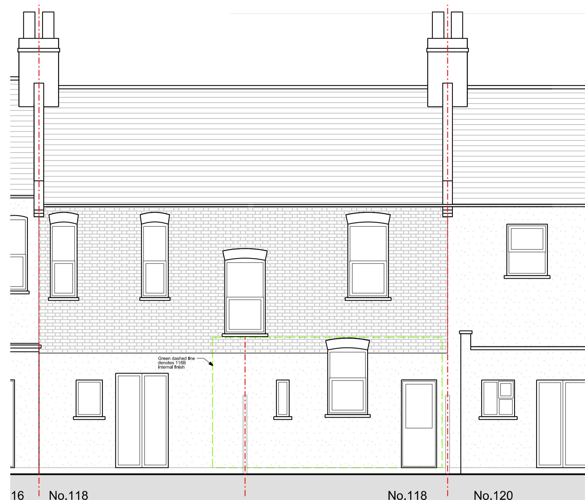
01 REAR ELEVATION EXISTING