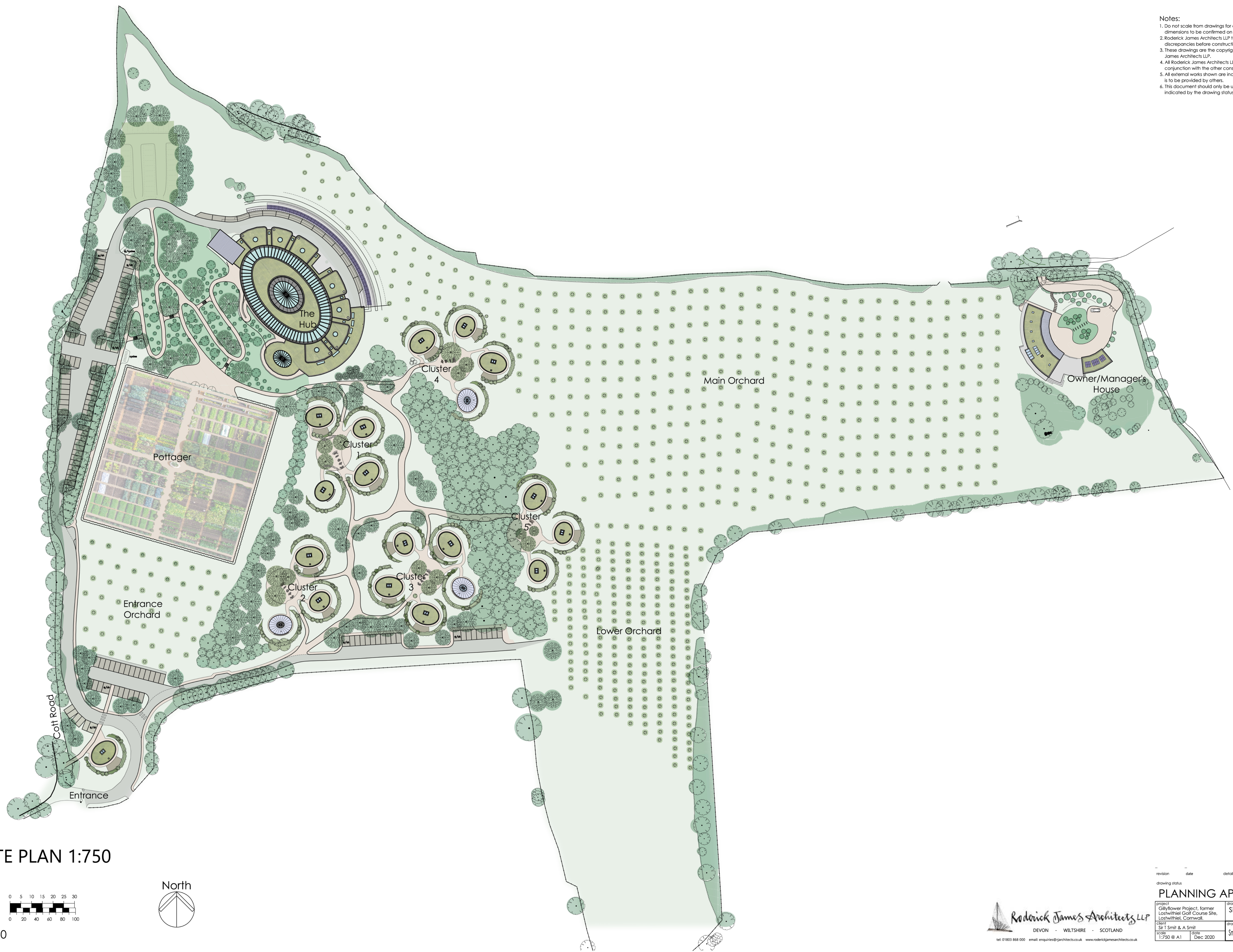
SITE PLAN 1:750

Notes: 1. Do not scale from drawings for construction purposes. All dimensions to be confirmed on site prior to construction. 2. Roderick James Architects LLP to be notified of any discrepancies before construction continues. 3. These drawings are the copyright property of Roderick James Architects LLP. 4. All Roderick James Architects LLP drawings to be read in conjunction with the other consultants' information. 5. All external works shown are indicative. Design and extent is to be provided by others. 6. This document should only be used for the purpose indicated by the drawing status below.