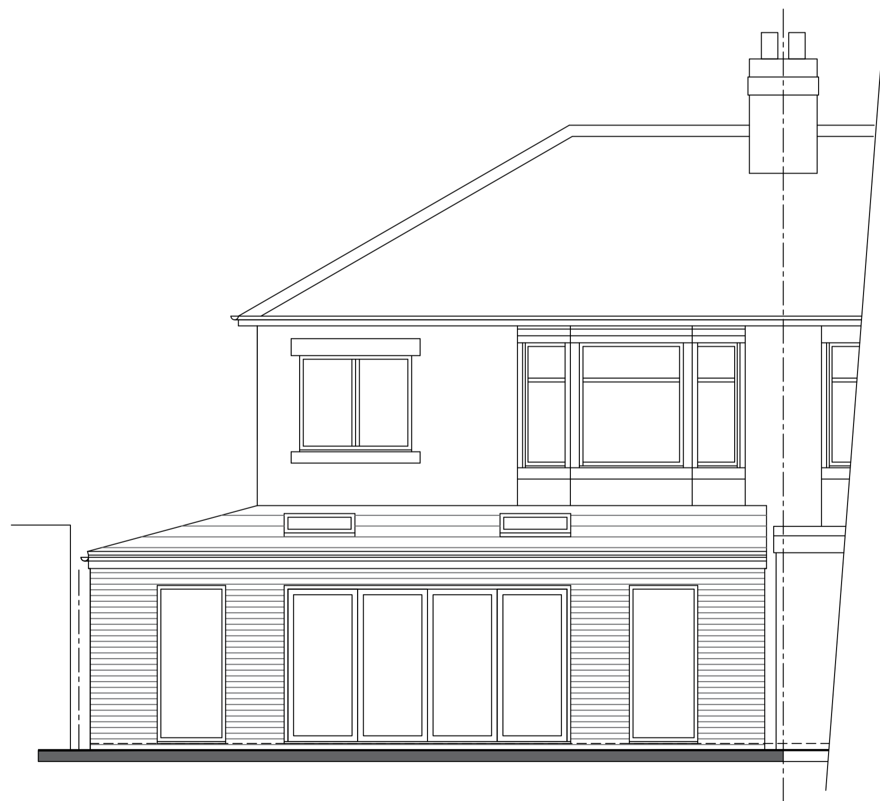
1:50 PROPOSED REAR ELEVATION