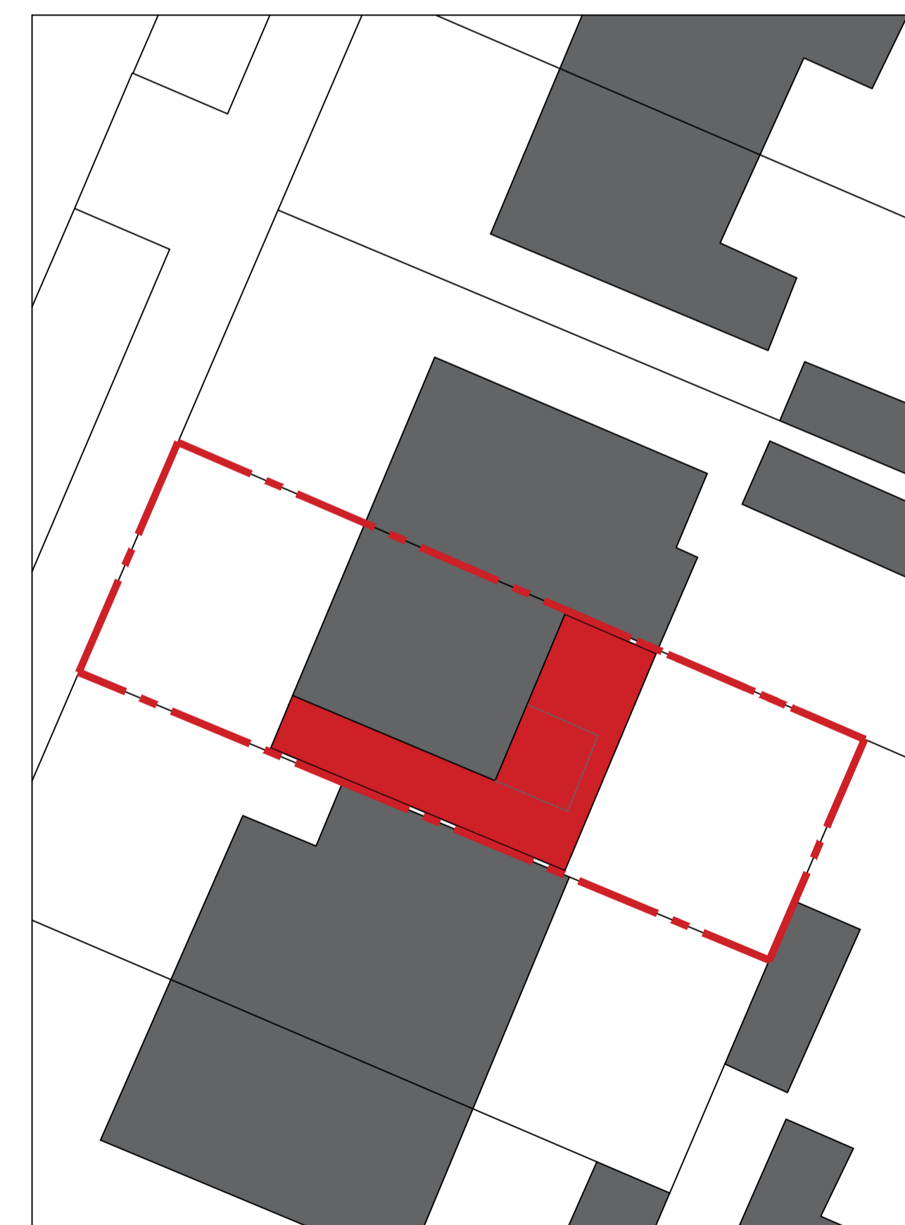
1:200 PROPOSED SITE PLAN