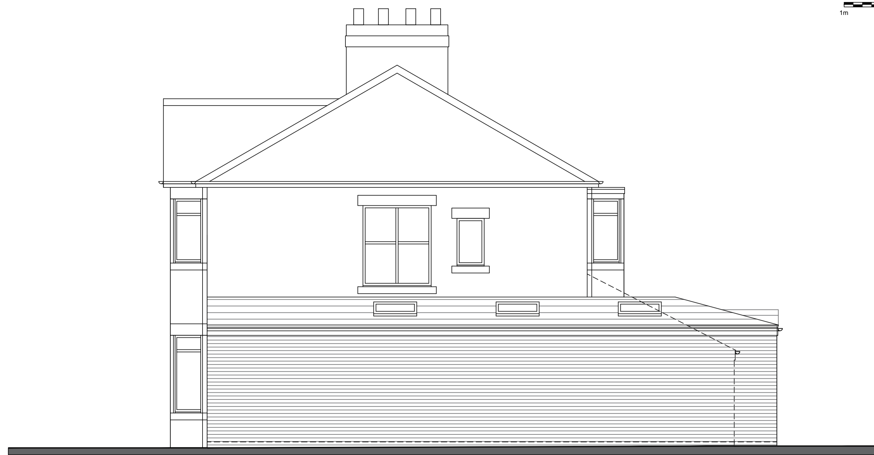
1:50 PROPOSED SIDE ELEVATION (To No.25 Broadway)