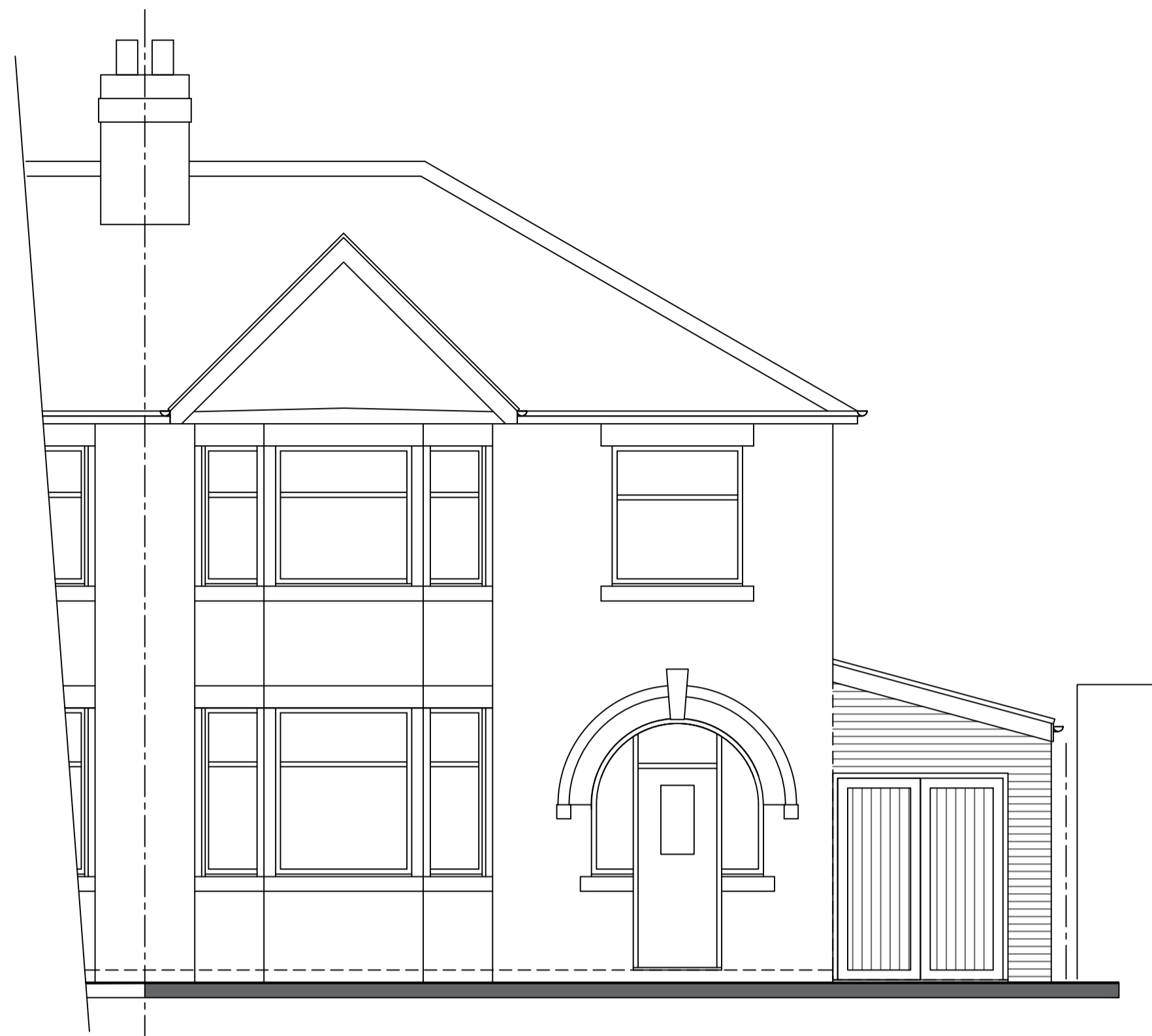
1:50 PROPOSED FRONT ELEVATION