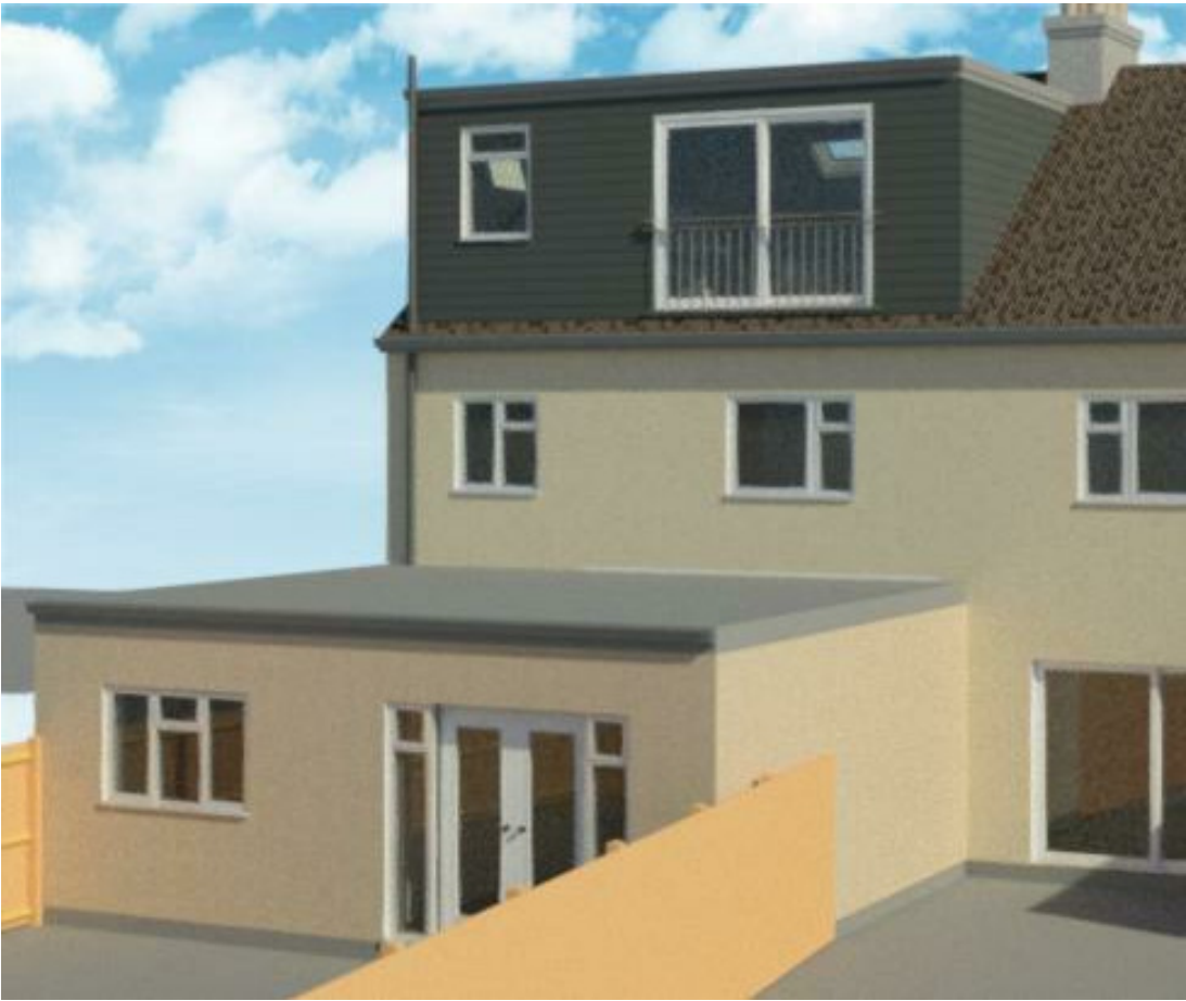
1 Proposed 3D View II. 1:1