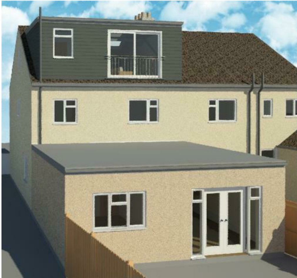
2 Proposed 3D View I. 1:1