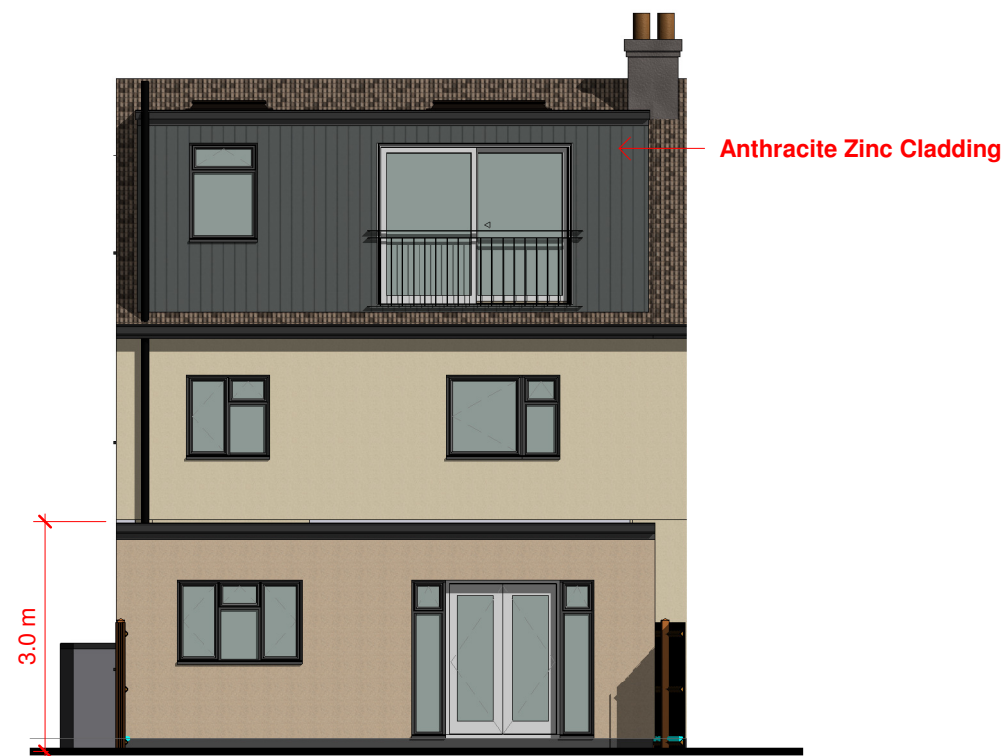
3 Proposed Rear Elevation. 1 : 100