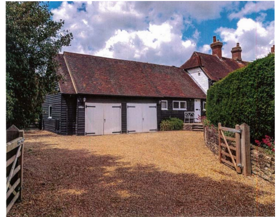
front elevation as existing - unaltered by internal changes

scale 1:50 (at A3) Date Sept '20 Ref 1630/05B