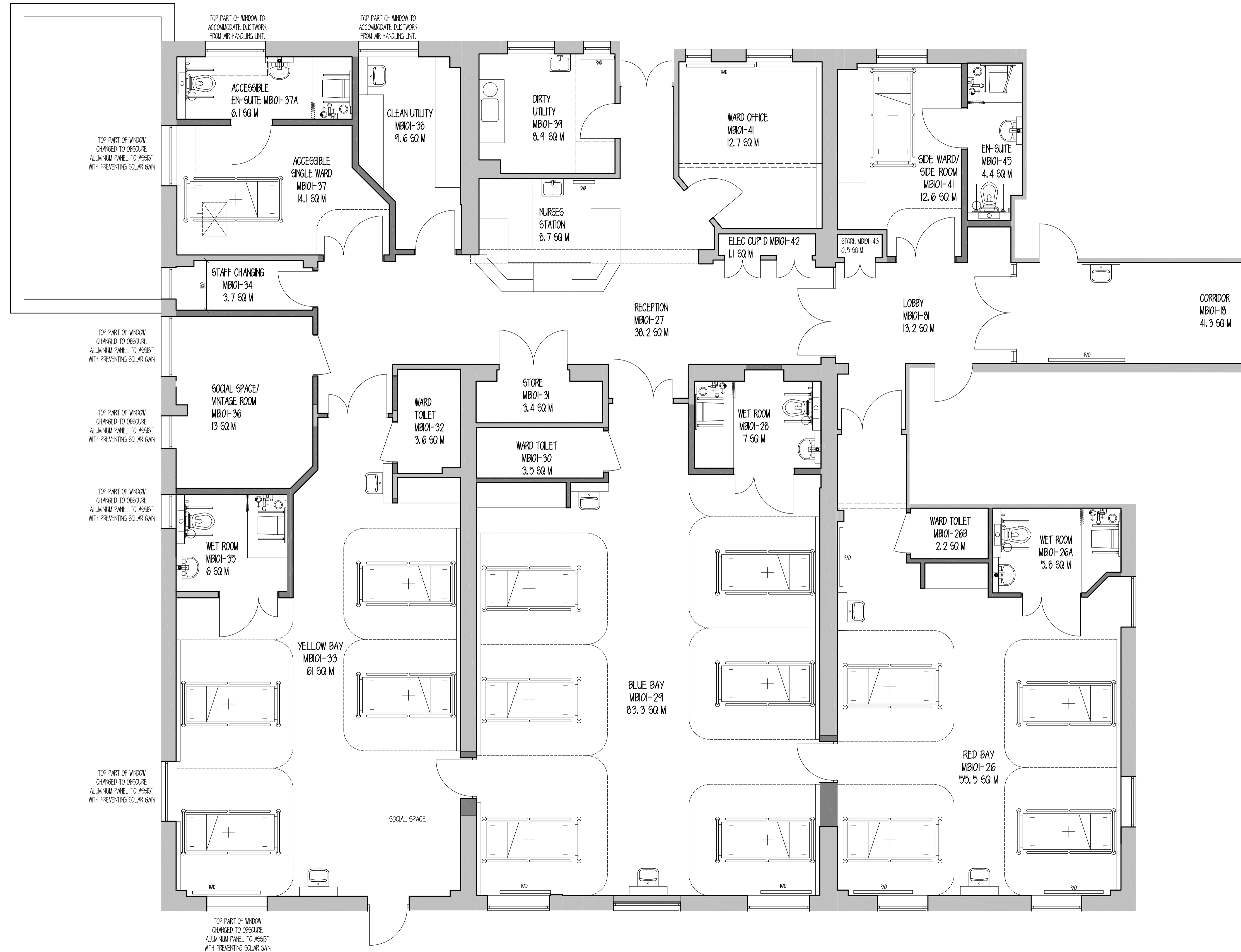
PART FIRST FLOOR PLAN