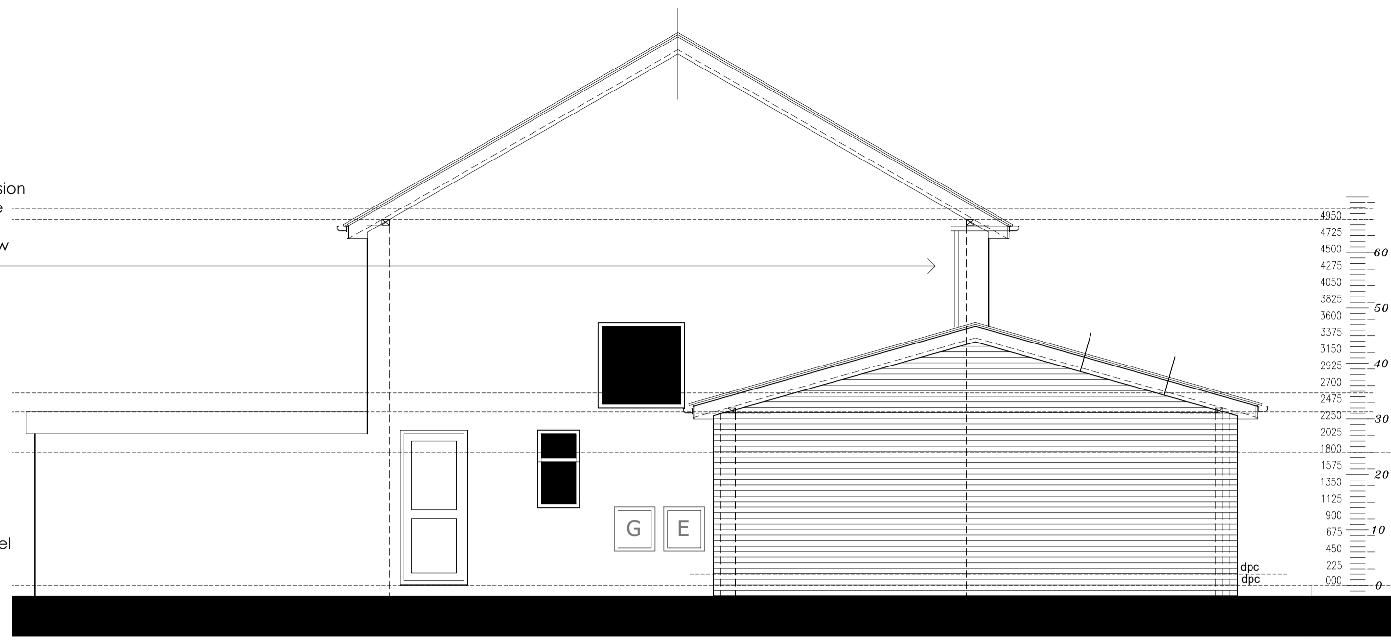
Proposed Gable Elevation 1: 50