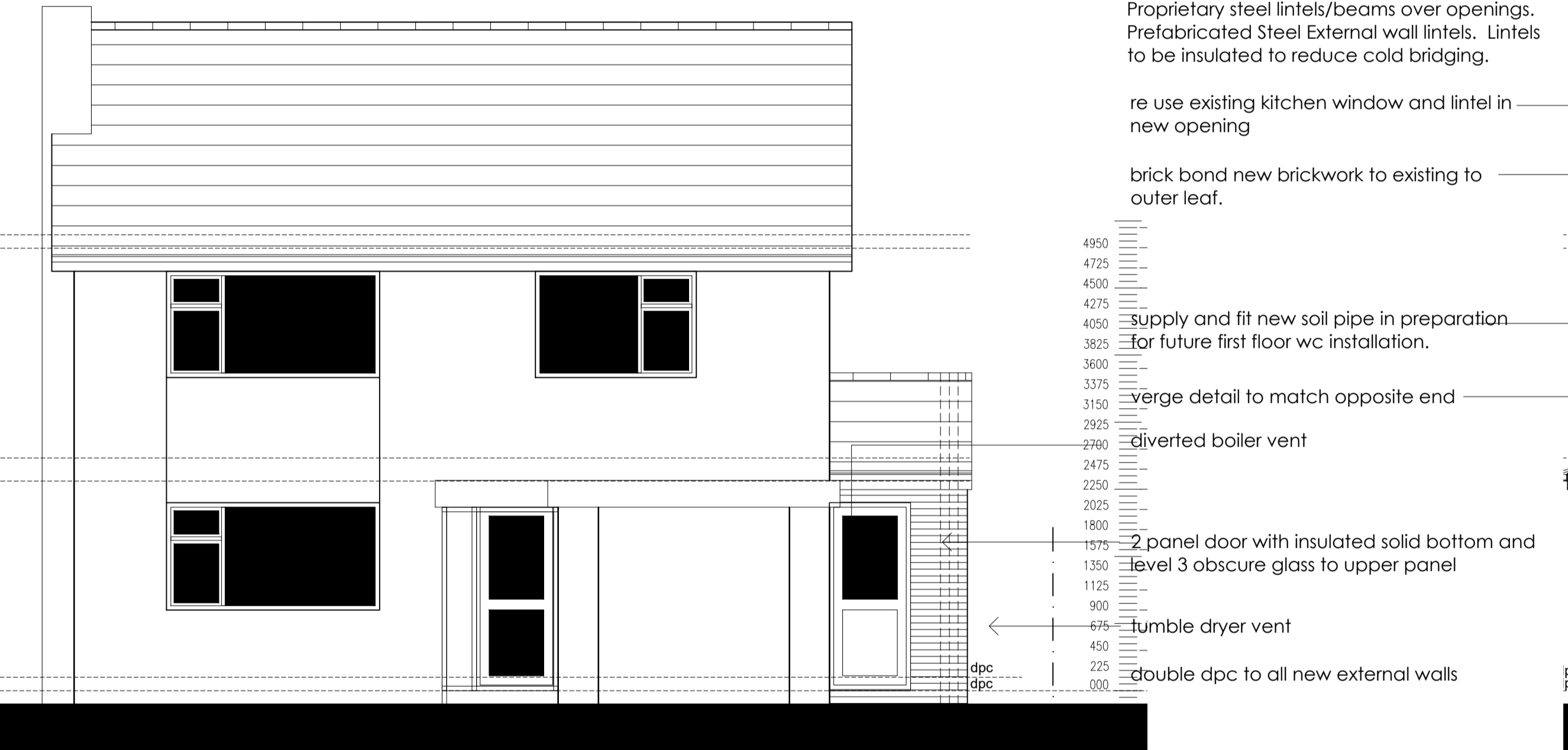
Front Elevation 1: 50