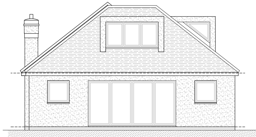
Rear (west-facing) Elevation 1:100