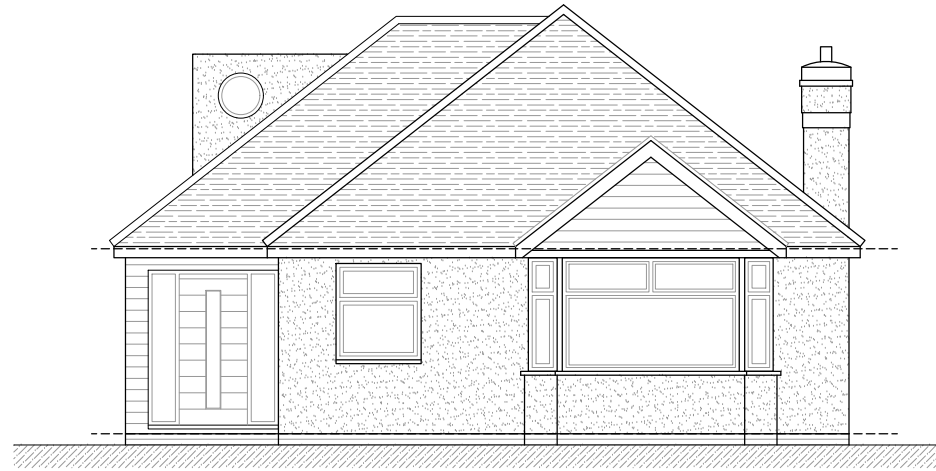
Front (east-facing) Elevation 1:100