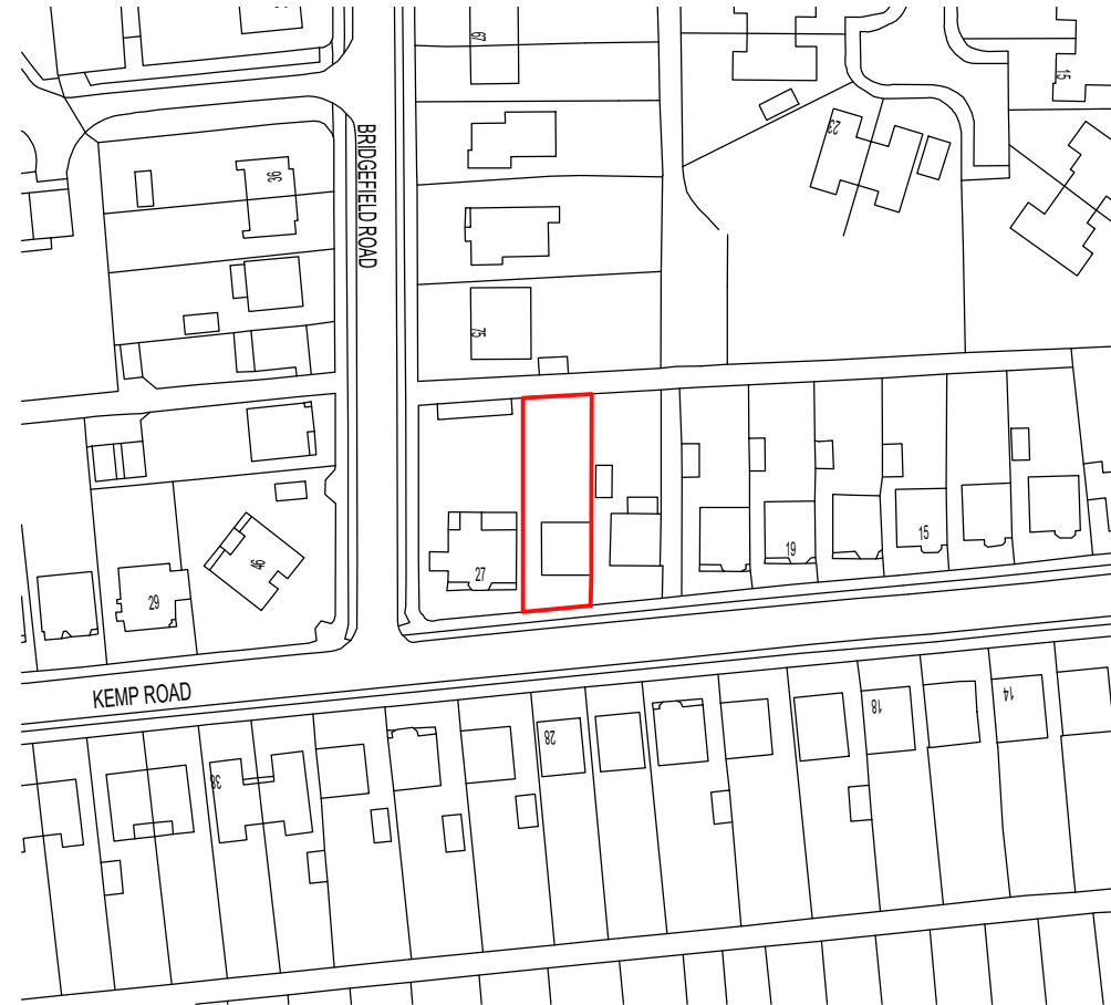
Site Location Plan 1:1250