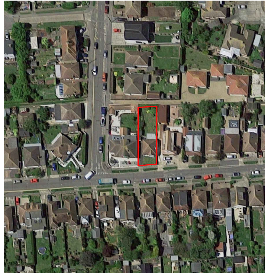
Aerial Location Plan 1:1250

25 Kemp Road, Whitstable Extensions and Internal Alterations Site Plans 1:1250 @ A3 01 /