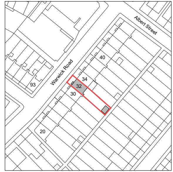
Existing Site Location Plan Scale 1:1250