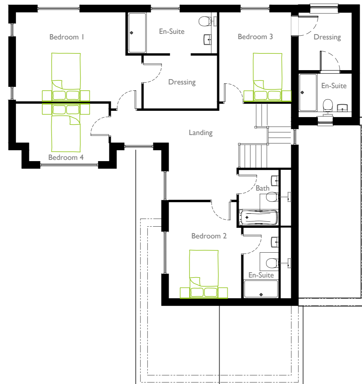
Proposed First Floor Plan