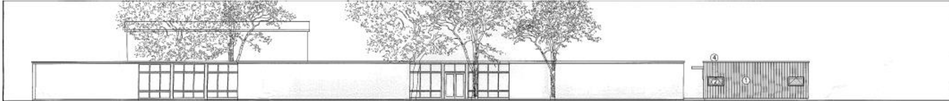
EXISTING AND PROPOSED WEST ELEVATION (NO CHANGE)