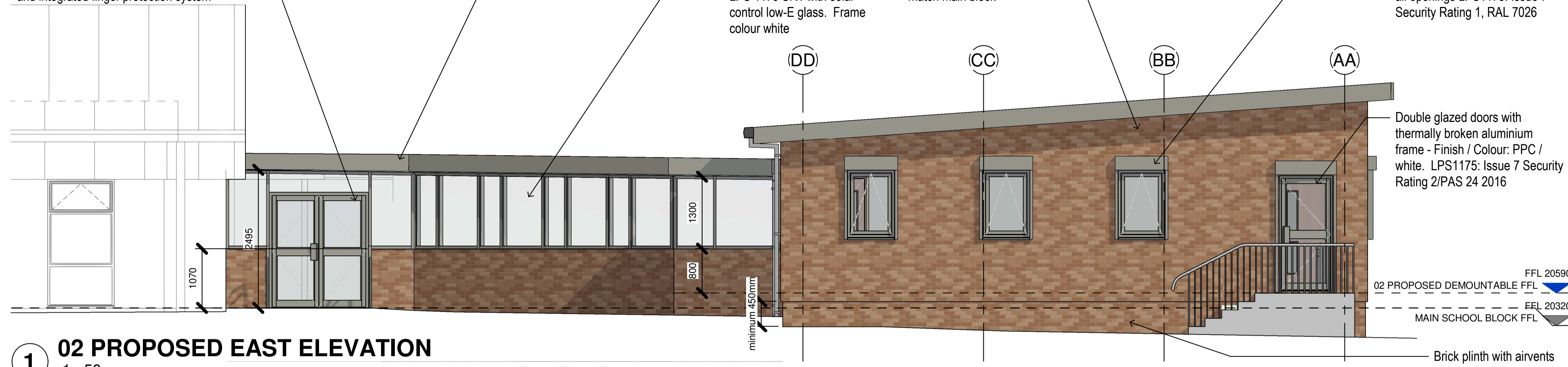
1 02 PROPOSED EAST ELEVATION 1 : 50

Double glazed doors with thermally broken aluminium frame - Finish / Colour: PPC / white. LPS1175: Issue 7 Security Rating 2/PAS 24 2016