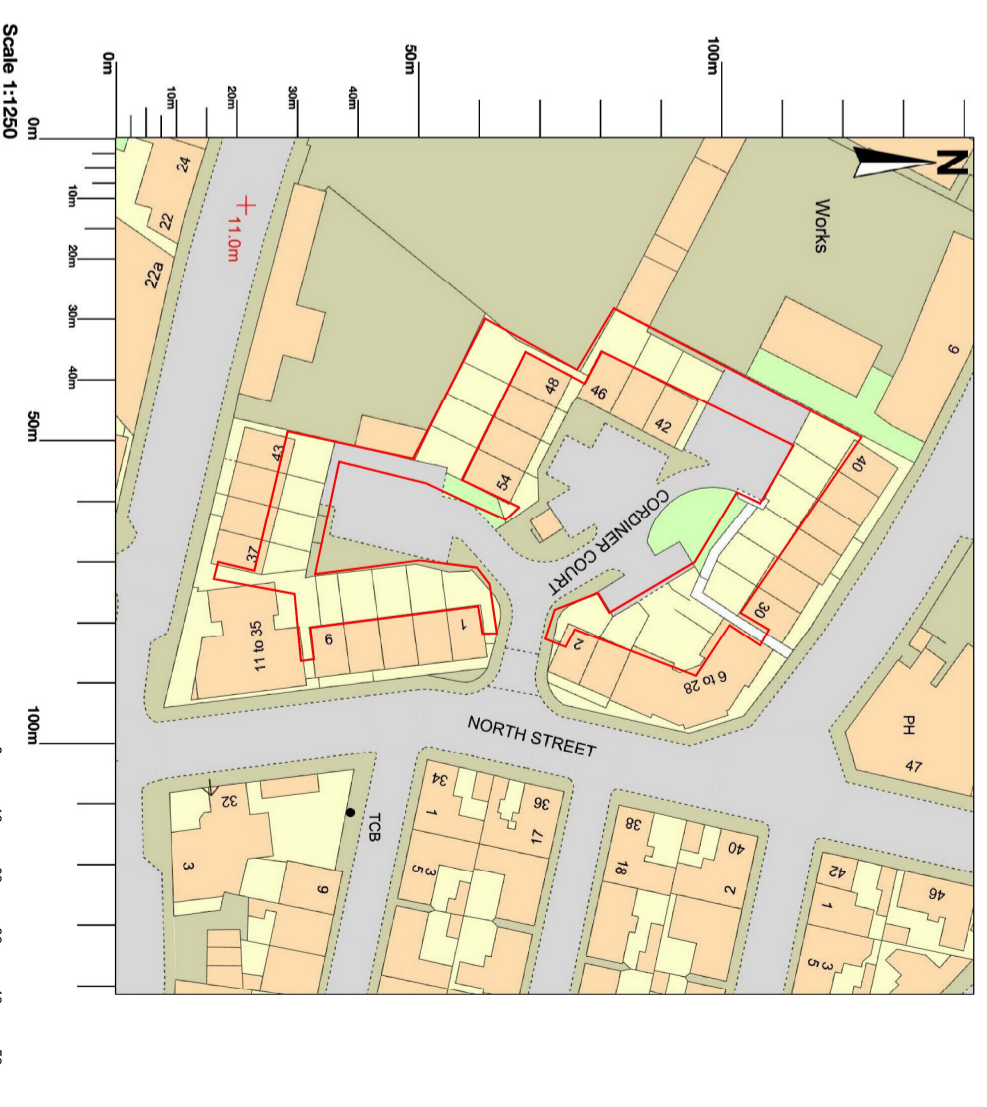
Scale 1:1250 (Paper size: A3)