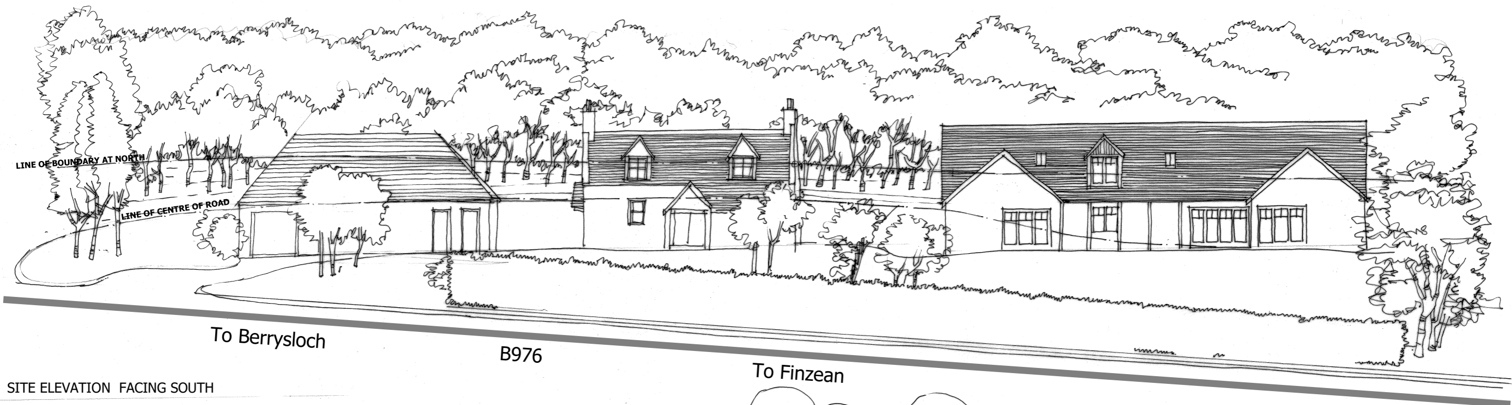
SITE ELEVATION FACING SOUTH