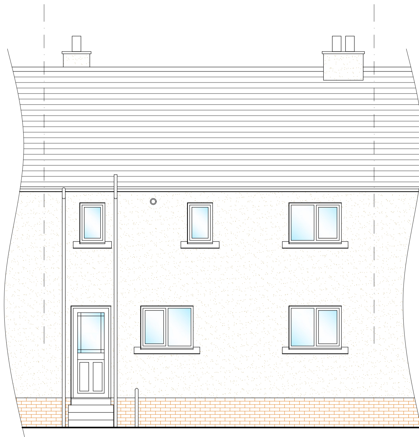
Existing Rear Elevation. 1:50.