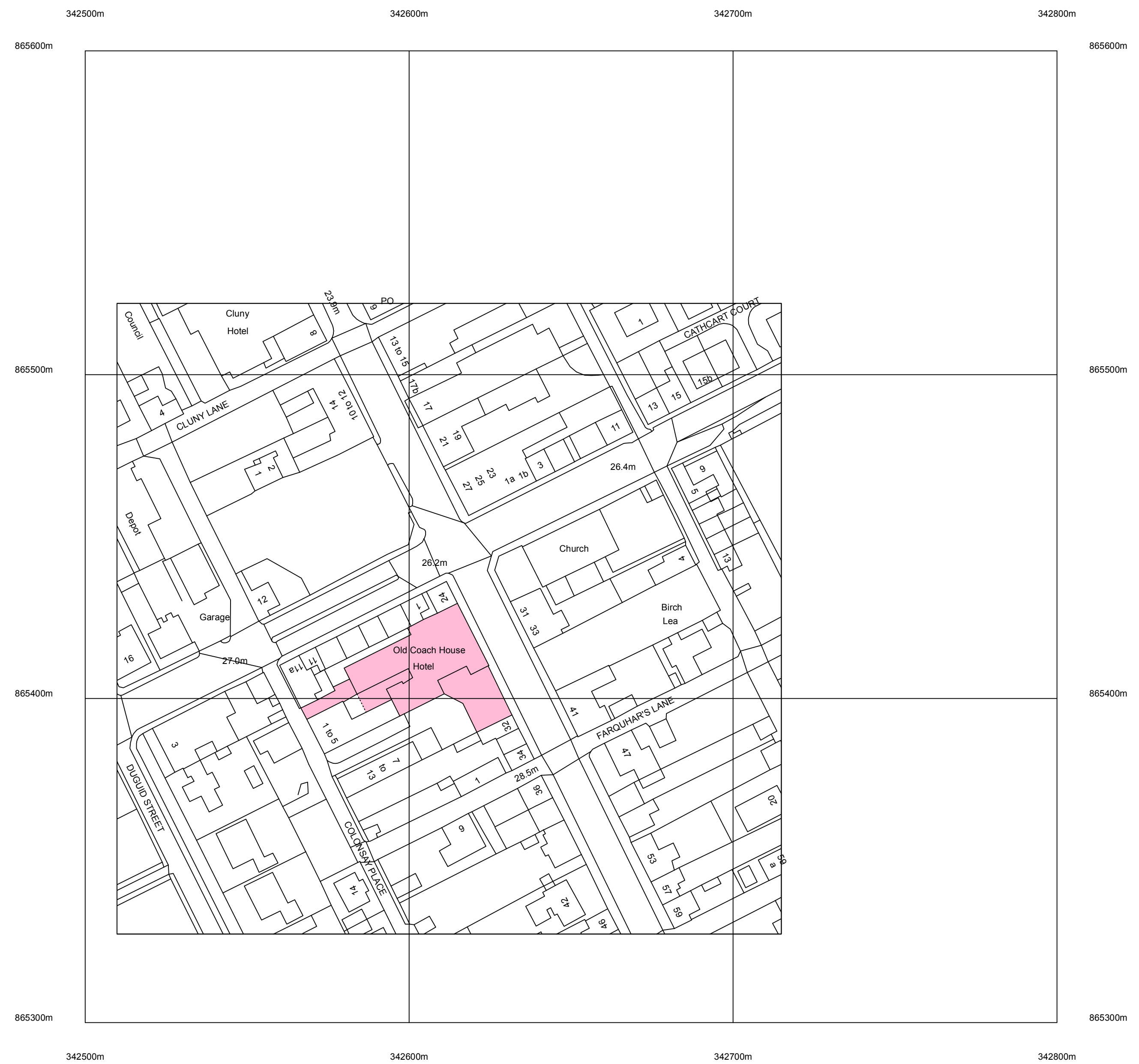
Location Plan. 1:1000