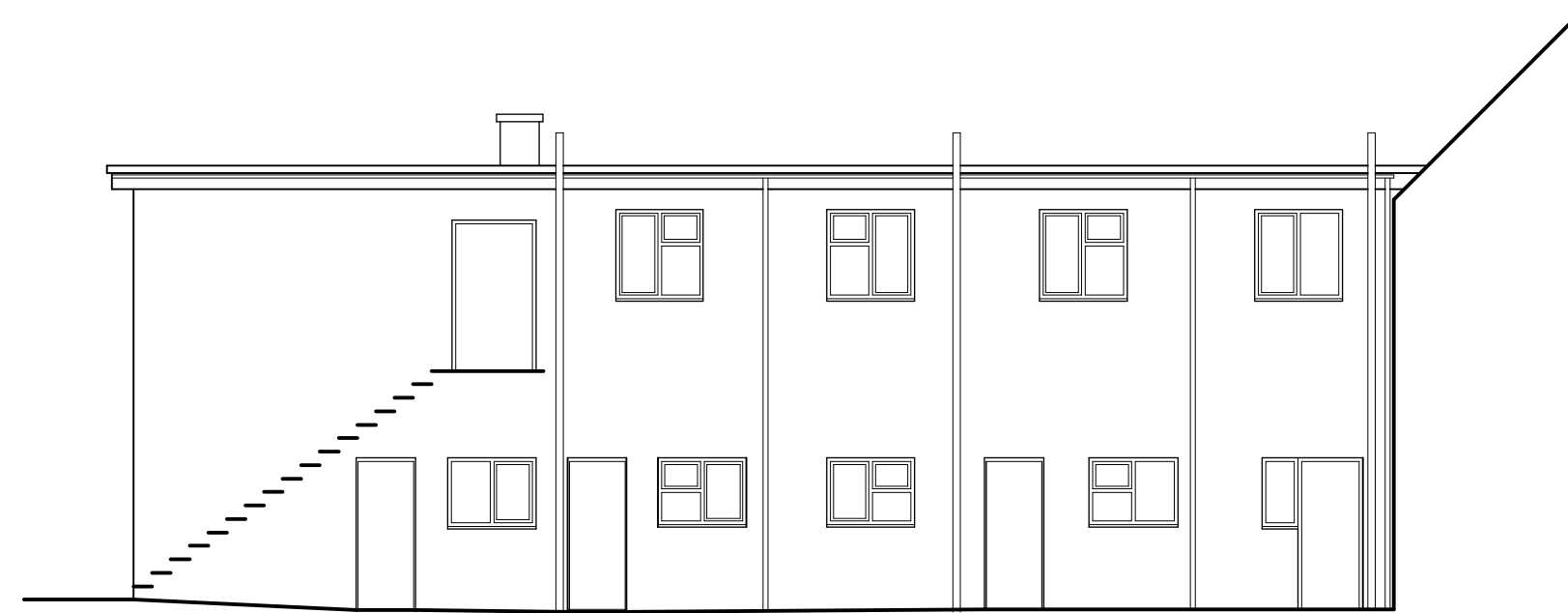
Elevation B. 1:100