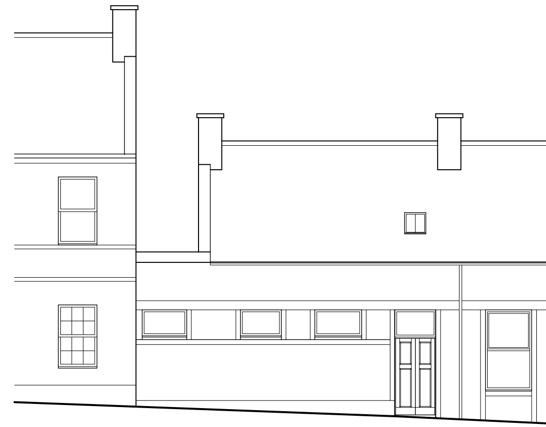
Elevation A. 1:100