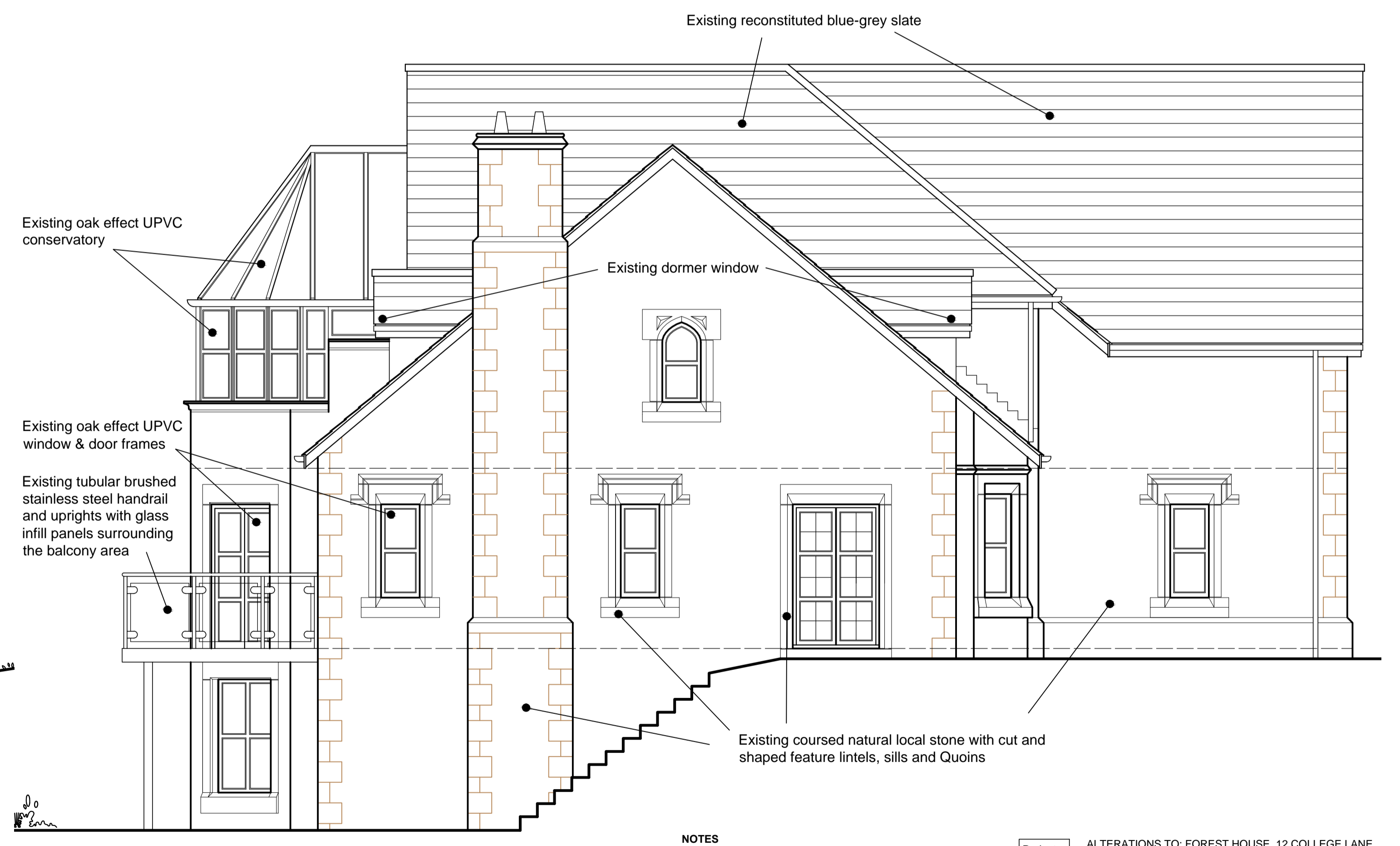
Existing North Elevation