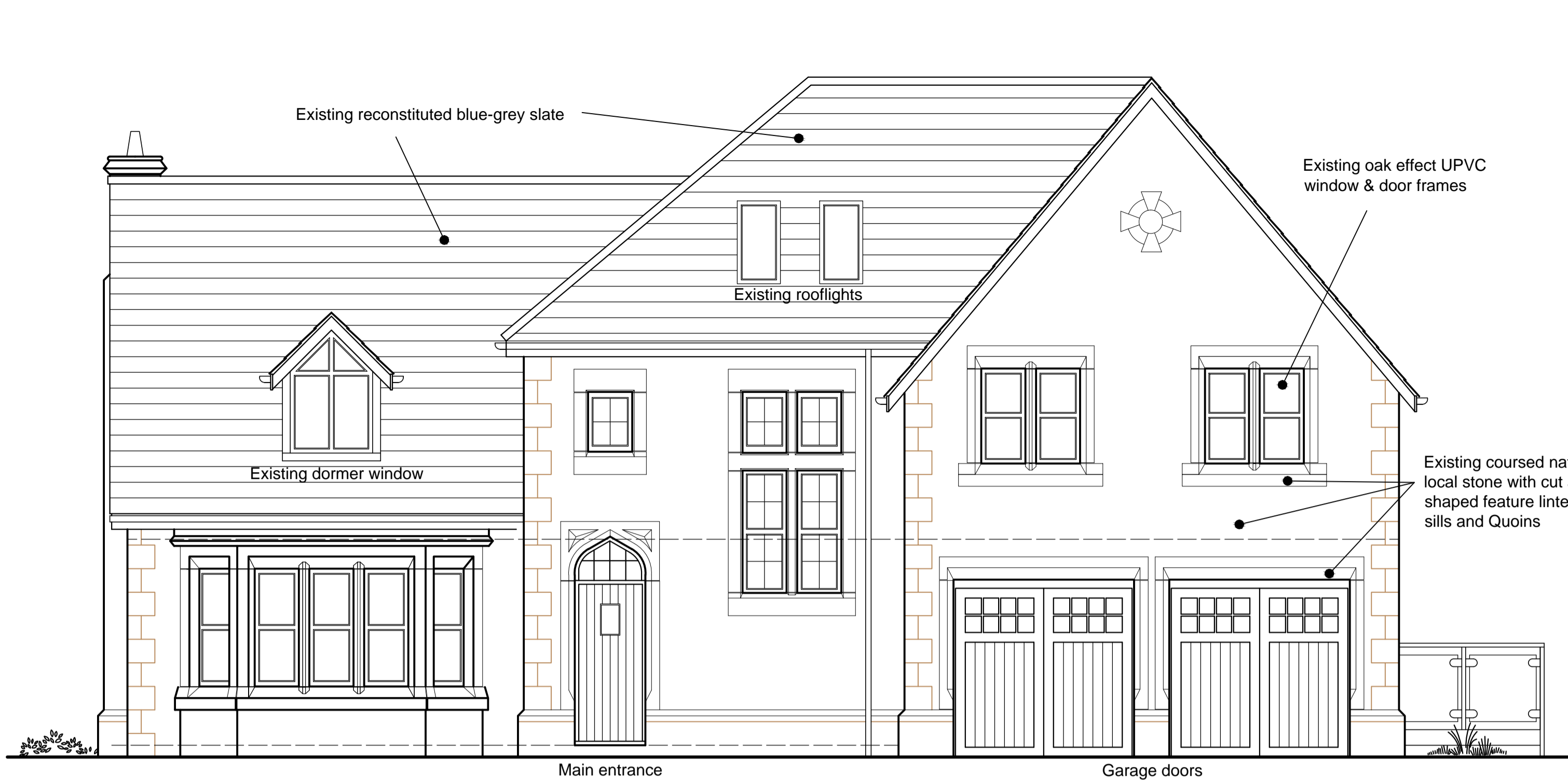
Existing West Elevation