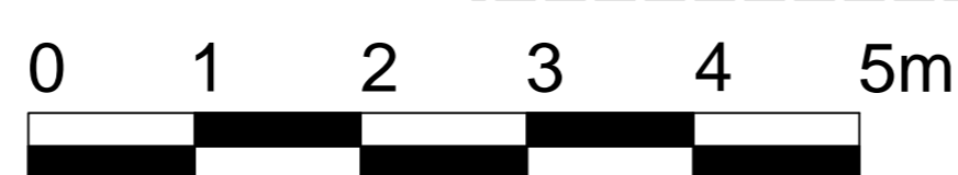
Proposed Floor Plans @ 1:50