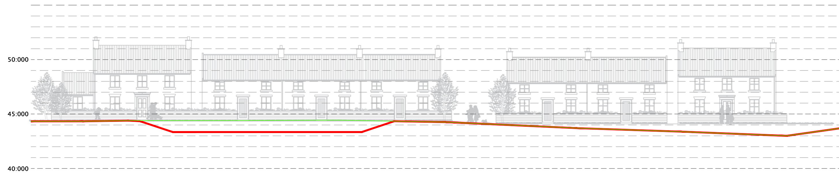
Section D-D BASIN IN LINE WITH ENGINEERS DRAWING (CLC-T-ESL-01)