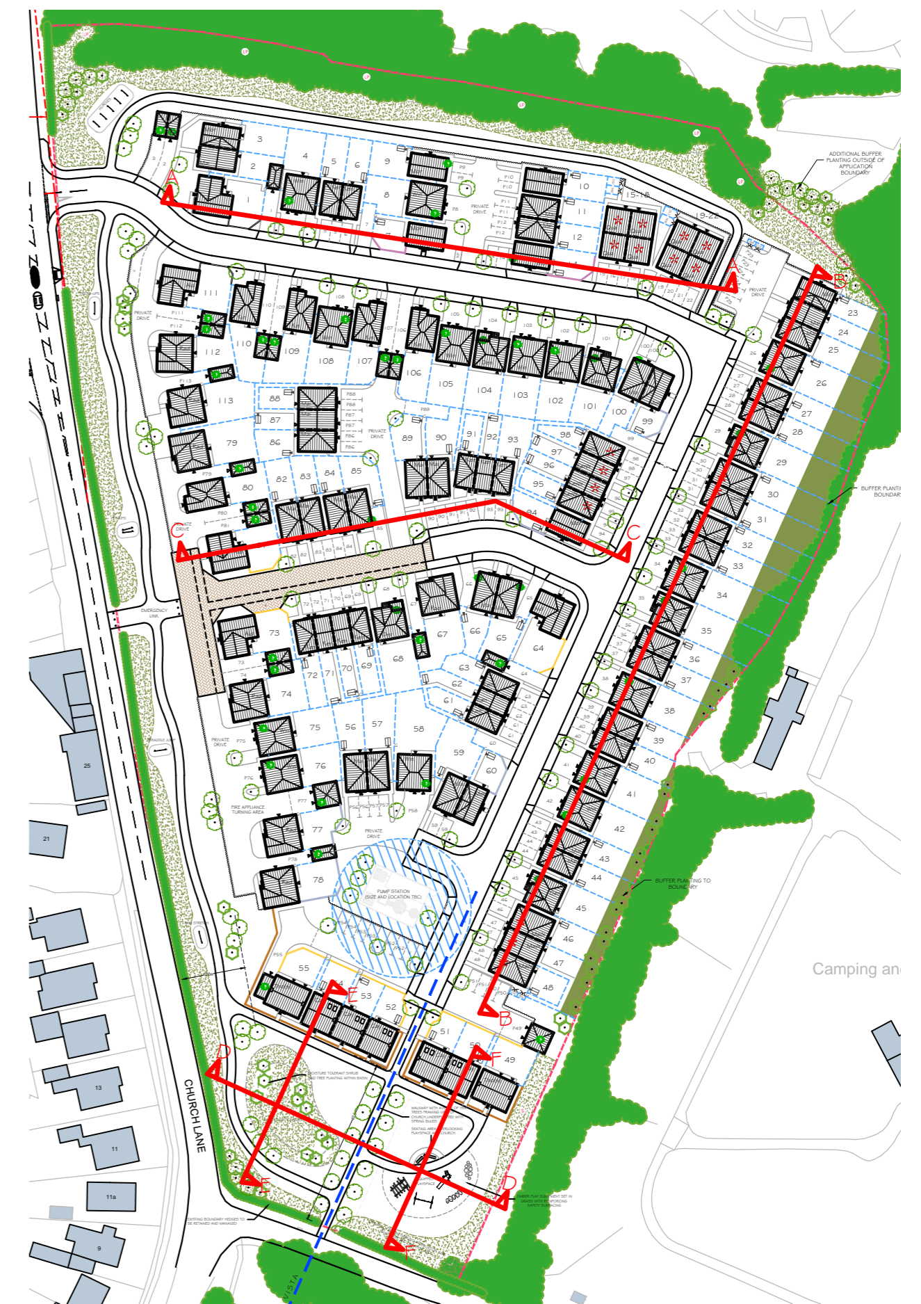
SITE LAYOUT NTS

NOTE: FFL levels subject to review by consulting engineer.