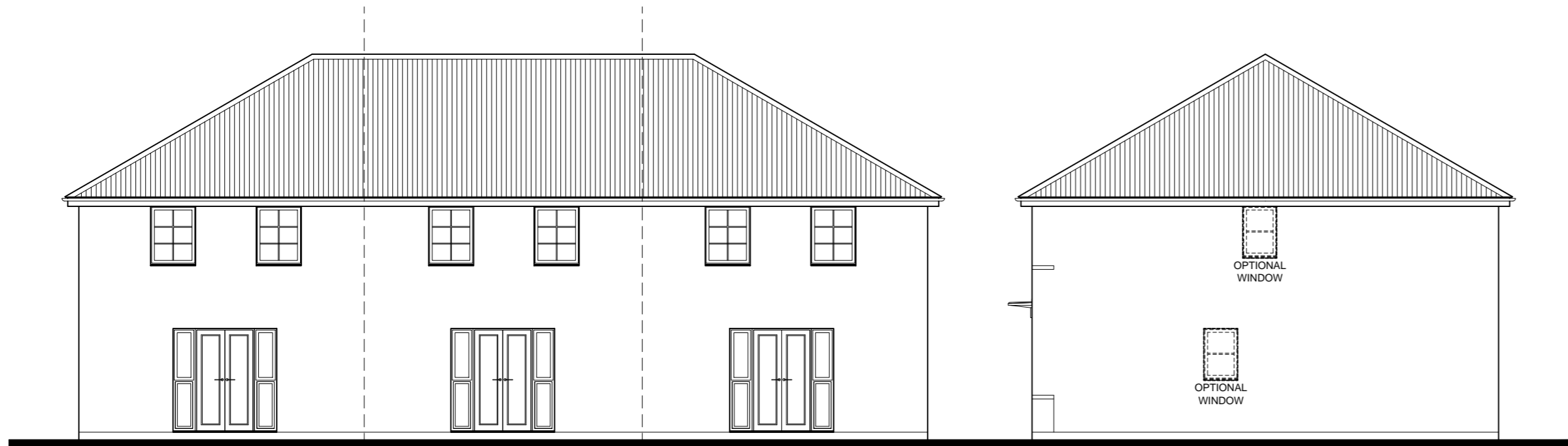
REAR ELEVATION MAIDSTONE (X)