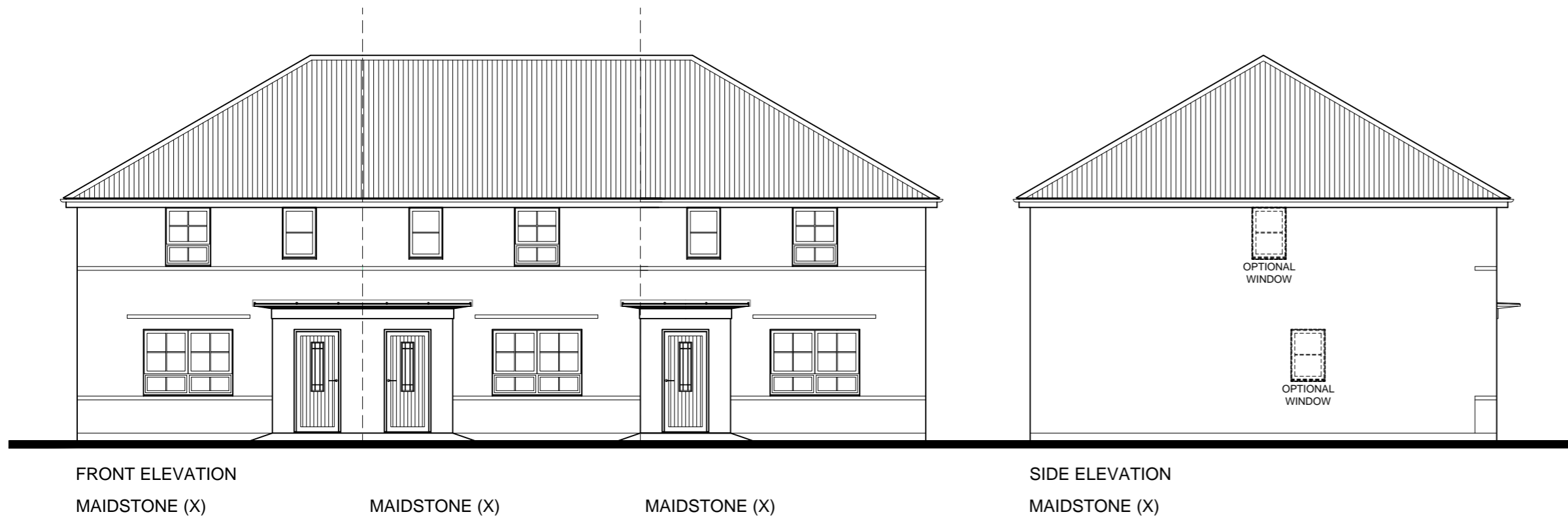
FRONT ELEVATION MAIDSTONE (X)