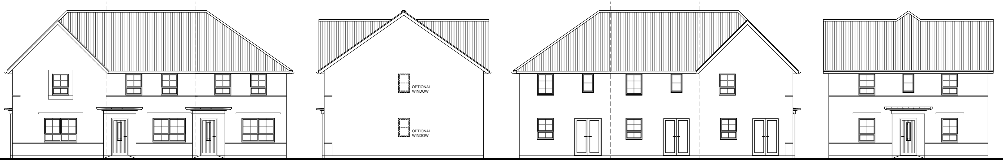
SIDE/FRONT ELEVATION MORESBY