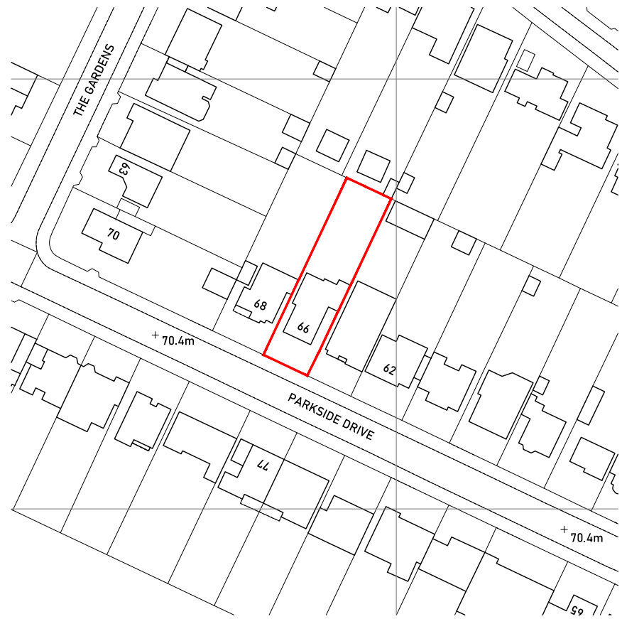
Site Location Plan Scale 1:1250 @ A3