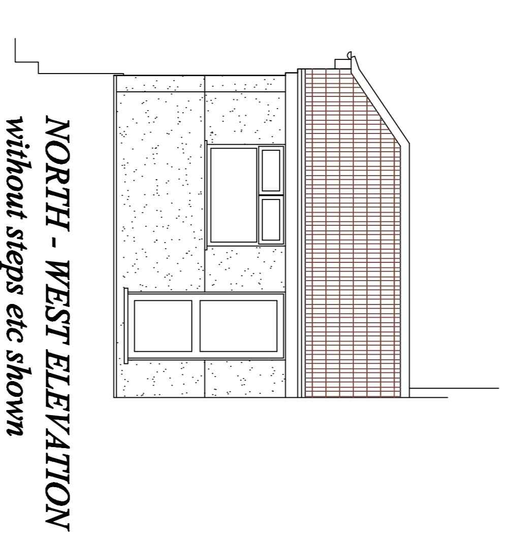
NORTH - WEST ELEVATION without steps etc shown