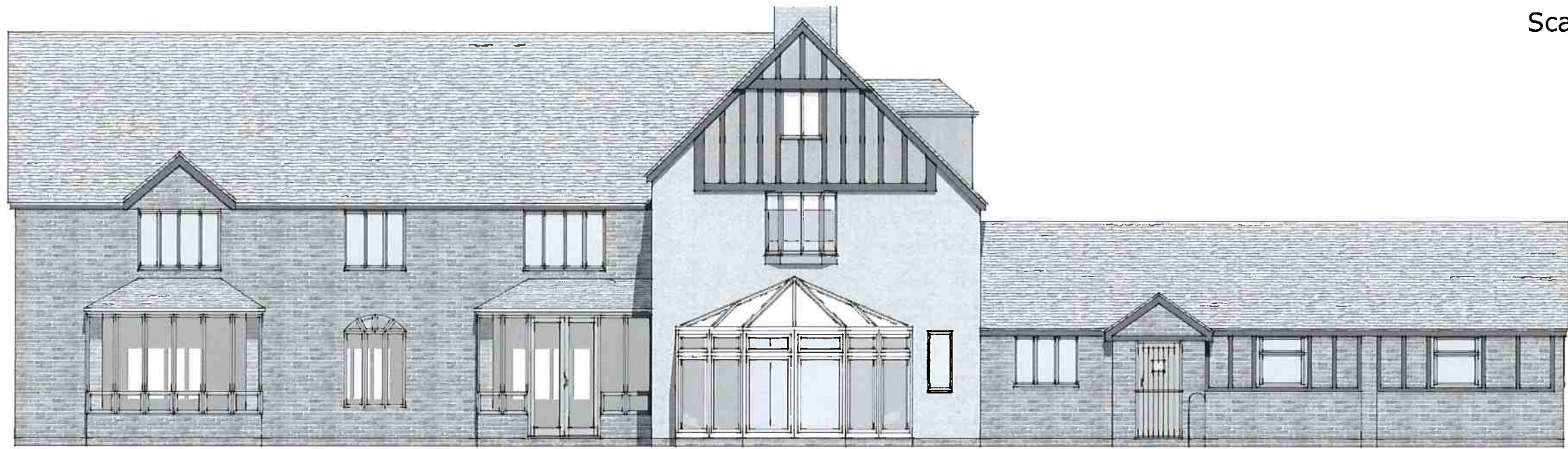
EXISTING REAR (SOUTH) ELEVATION