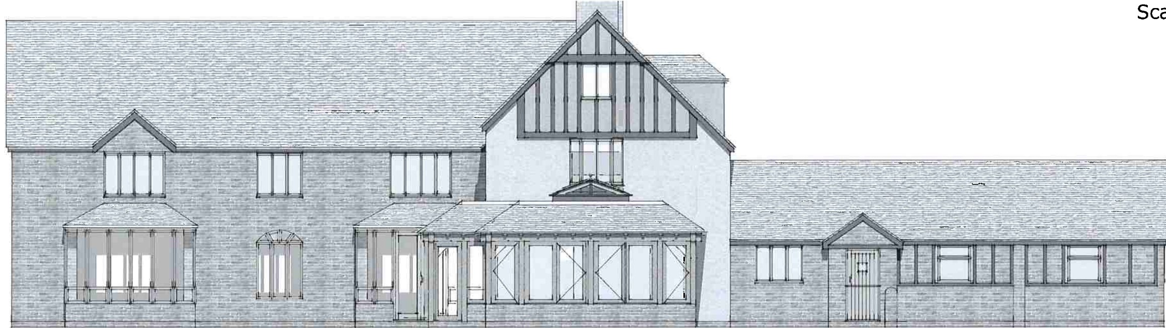
PROPOSED REAR (SOUTH) ELEVATION