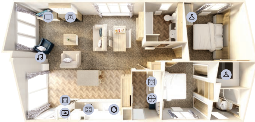
Pinehurst • 40 x 20 • 2 bedroom • sleeps 4