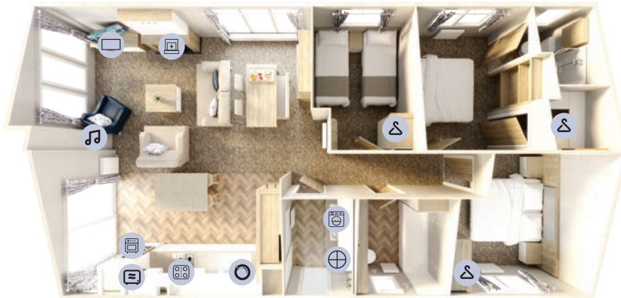
Pinehurst • 40 x 20 • 3 bedroom • sleeps 6