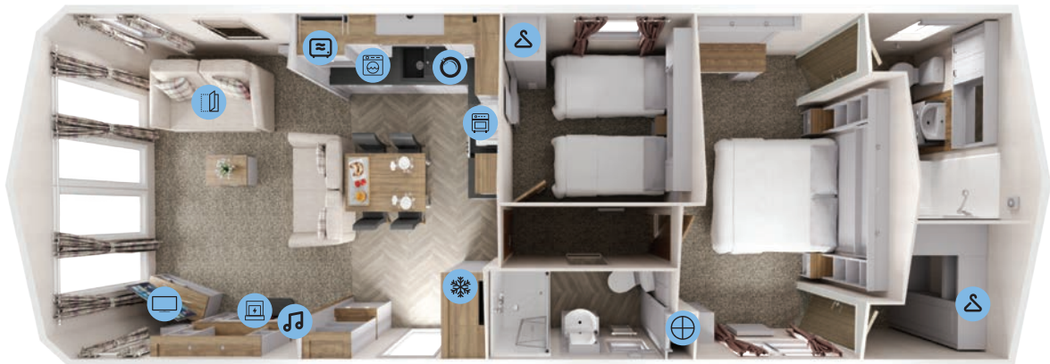
Sheraton Elite • 42 x 14 • 2 bedroom • Sleeps 6