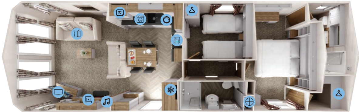
Sheraton • 40 x 13 • 2 bedroom • Sleeps 6