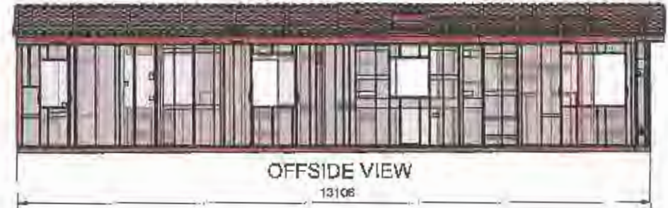
OFFSIDE VIEW 13108