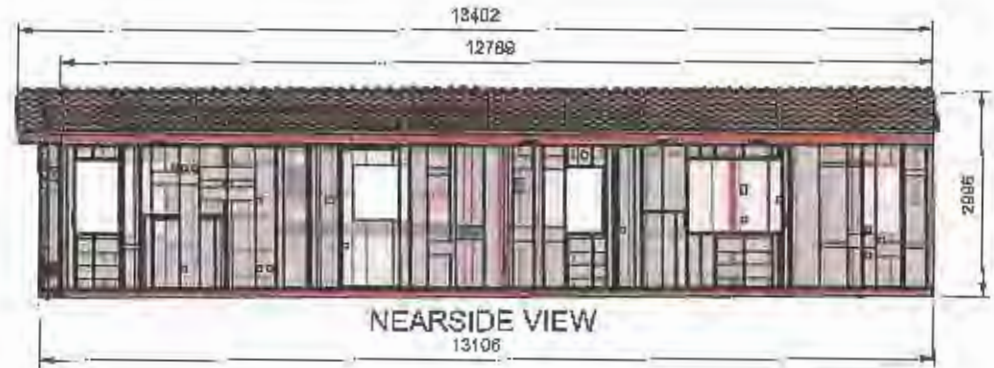
NEARSIDE VIEW 13108