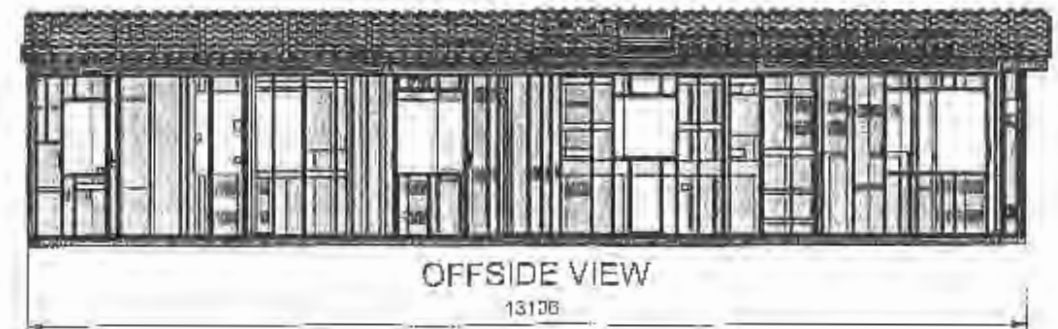
OFFSIDE VIEW 13106