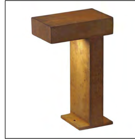
3/9/19 Image C Floor Mounted Lighting Post Please refer to Dwg BBA778.B.02B Site Plan

This Drawing is Copyright. © Note: All dimensions to be checked on site and not to be scaled from drawing.