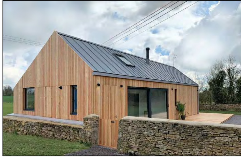
Image B Timber Cladding