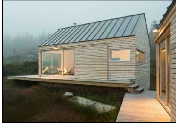
Image A Zinc Roof Cladding With Upstand Profile