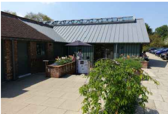
Photo View 02 - Existing Entrance to Visitor Centre