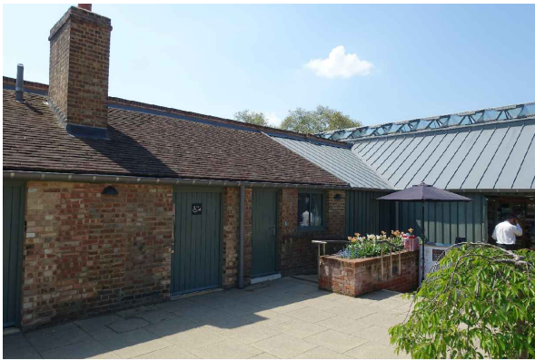
Photo View 01 - Existing Entrance to Visitor Centre