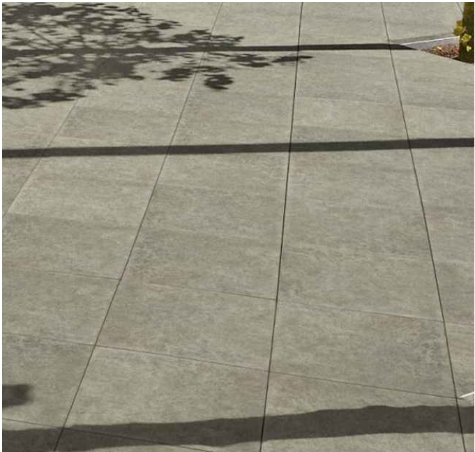
03 Marshall's Urbex textured paving to match existing

GENERAL NOTES: 1. DO NOT SCALE FROM THIS DRAWING. DIMENSIONS GOVERN. 2. ALL DIMENSIONS ARE IN METRES UNLESS NOTED OTHERWISE. 3. ALL DIMENSIONS SHALL BE VERIFIED ON SITE BEFORE PROCEEDING WITH THE WORK. 4. JON SHEAFF AND ASSOCIATES SHALL BE NOTIFIED IN WRITING OF ANY DISCREPANCIES. 5. ALL DIMENSIONS ARE NOMINAL DIMENSIONS. 6. JON SHEAFF AND ASSOCIATES ACCEPT NO LIABILITY FOR ANY EXPENSE LOSS OR DAMAGE OF WHATEVER NATURE AND HOWEVER ARISING FROM ANY VARIATION MADE TO THIS DRAWING OR IN THE EXECUTION OF THE WORK TO WHICH HAS NOT BEEN REFERRED TO THEM AND PRIOR APPROVAL OBTAINED.