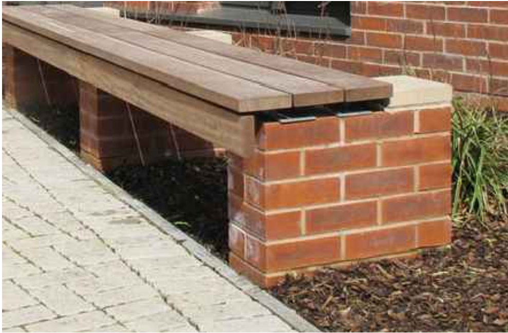
01 Timber slatted backless bench to match existing