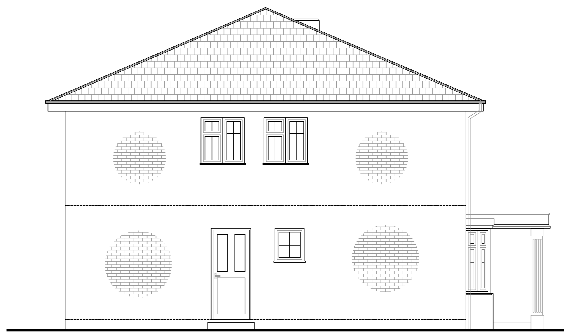
Left Side Elevation (South East)