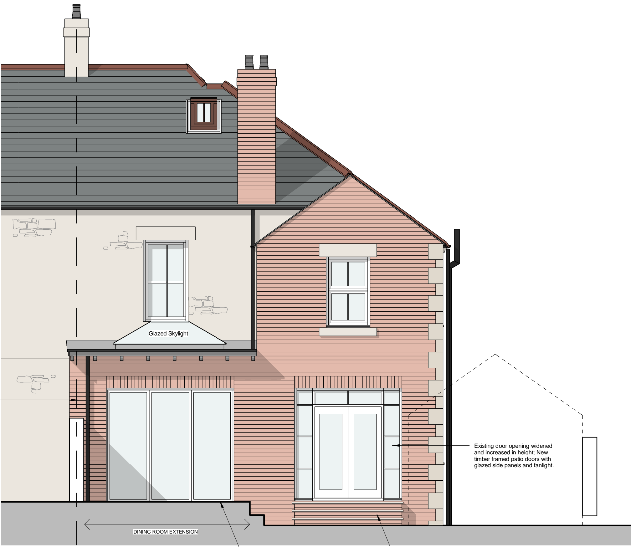
PROPOSED EAST (REAR) ELEVATION