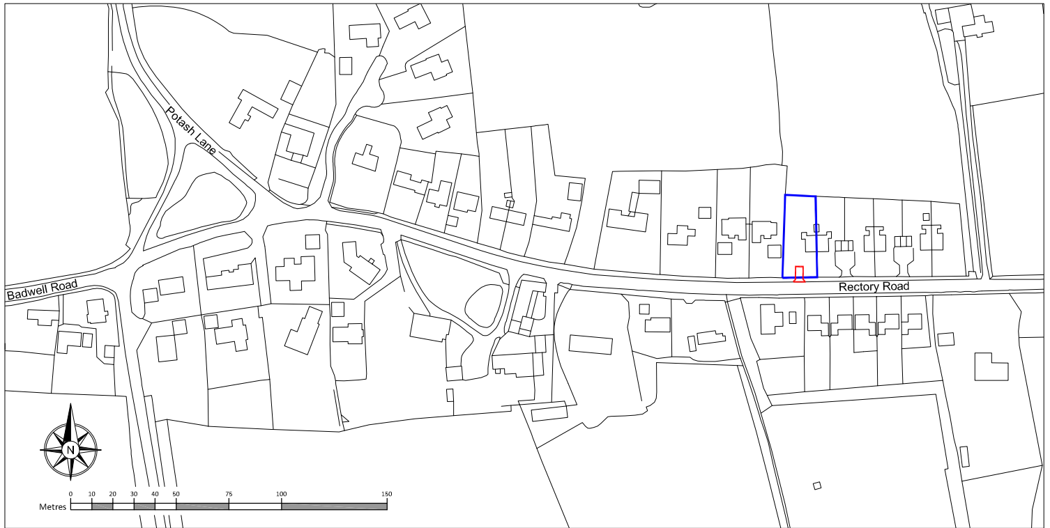
Location Plan Scale 1:2500

This drawing must not be resused, loaned or copied without the written consent of the originator. All errors, omissions, discrepancies should be reported to the originator immediately. All dimensions to be checked before site fabrication by the contractor, his sub-contractor or supplier. Do not scale plans - use figure or grid dimensions where given. Any deviation from the drawing to be reported to the originator immediately.