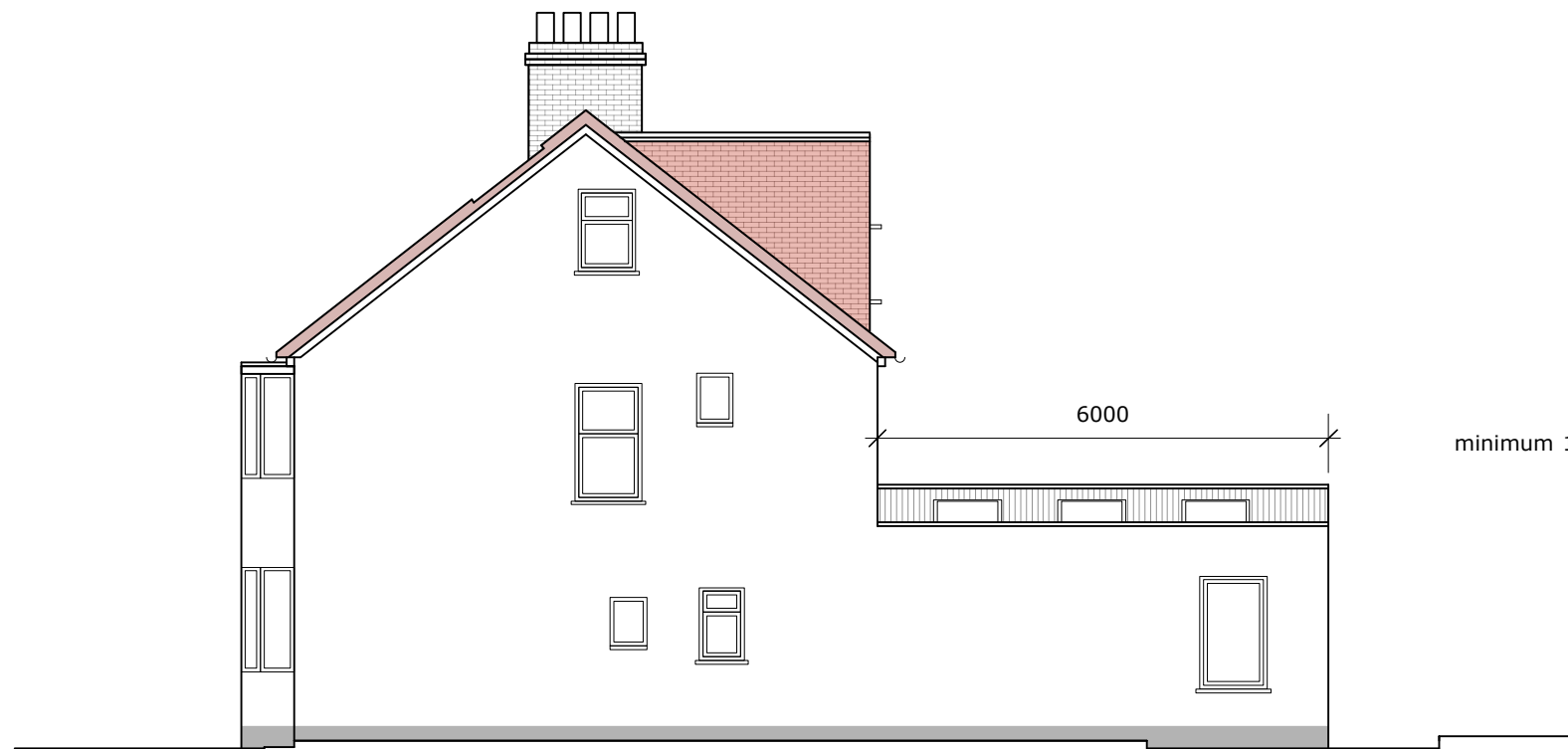
Flank Elevation (as seen from unattached neighbour)