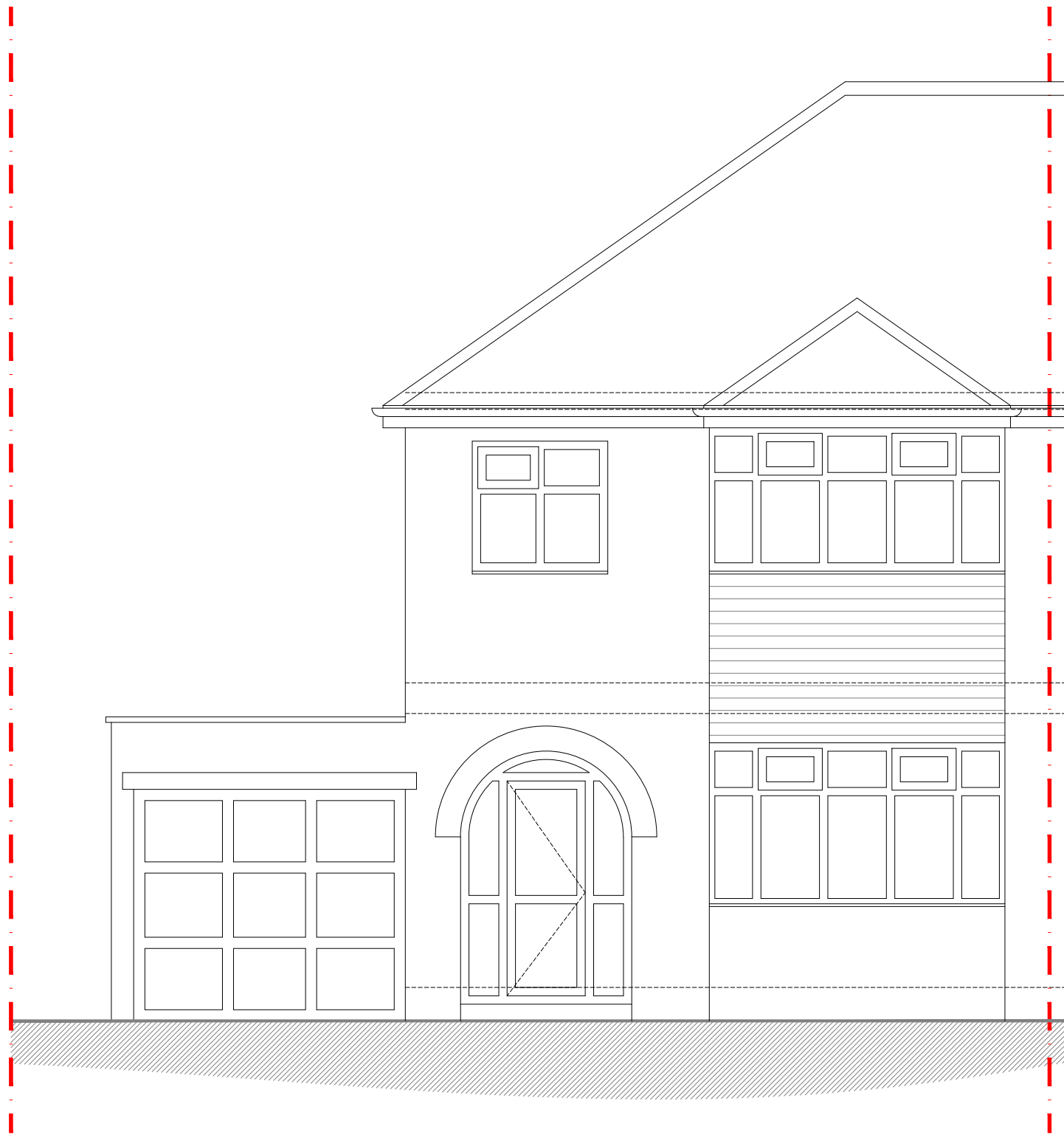
EXISTING FRONT ELEVATION - (1:50)