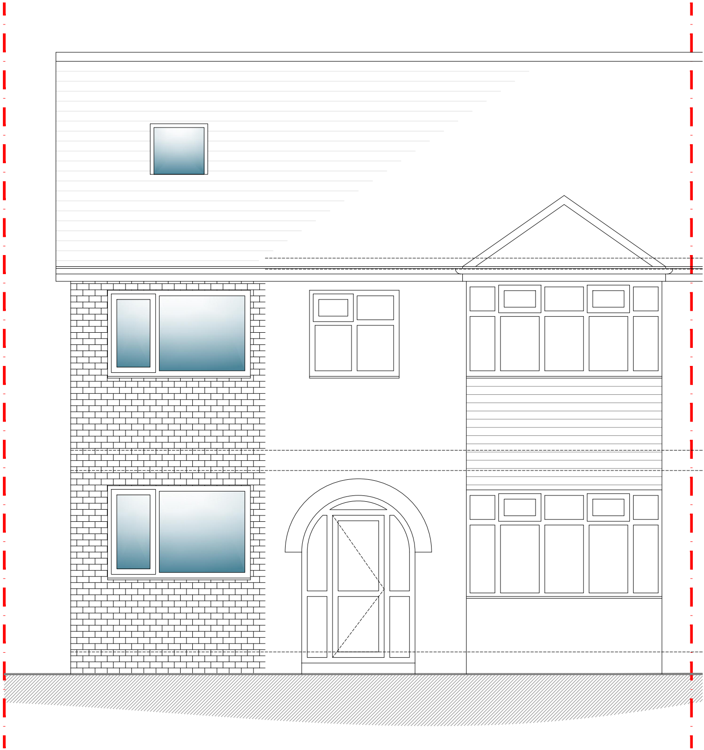
PROPOSED FRONT ELEVATION - (1:50)