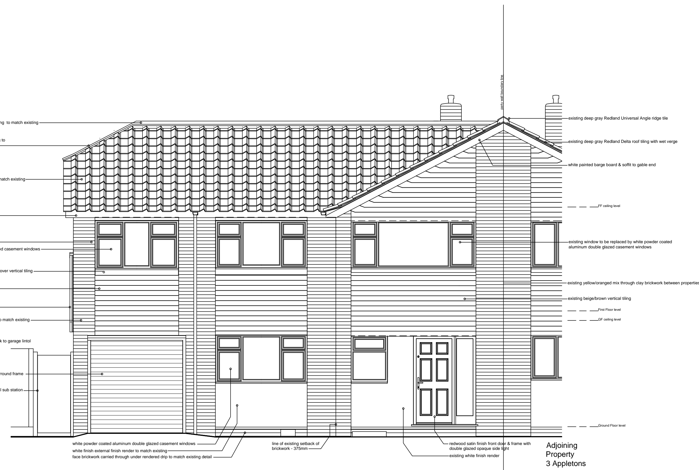
Proposed Front Elevation North Western Aspect on to APPLETONS