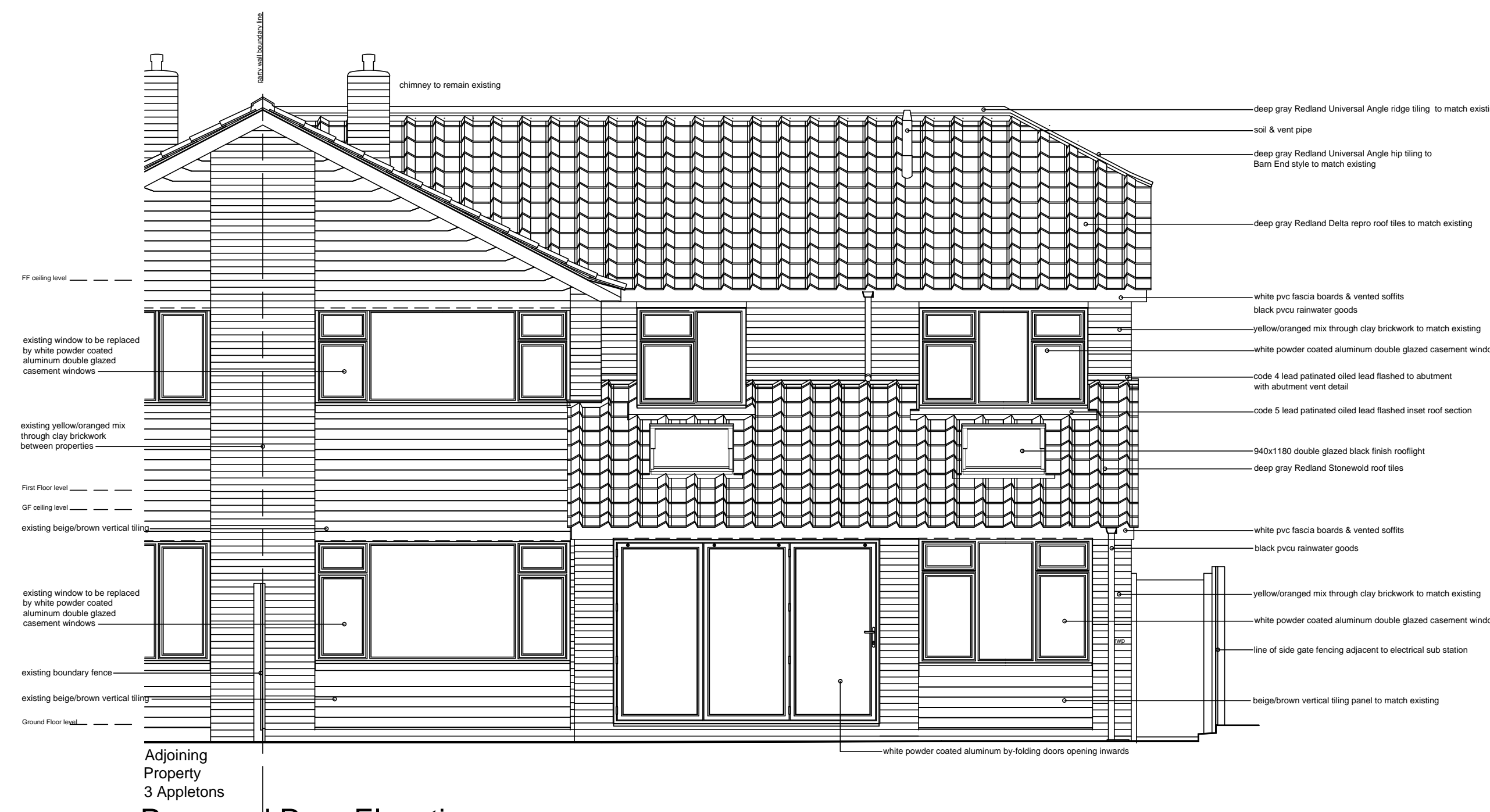
Proposed Rear Elevation South Eastern Aspect