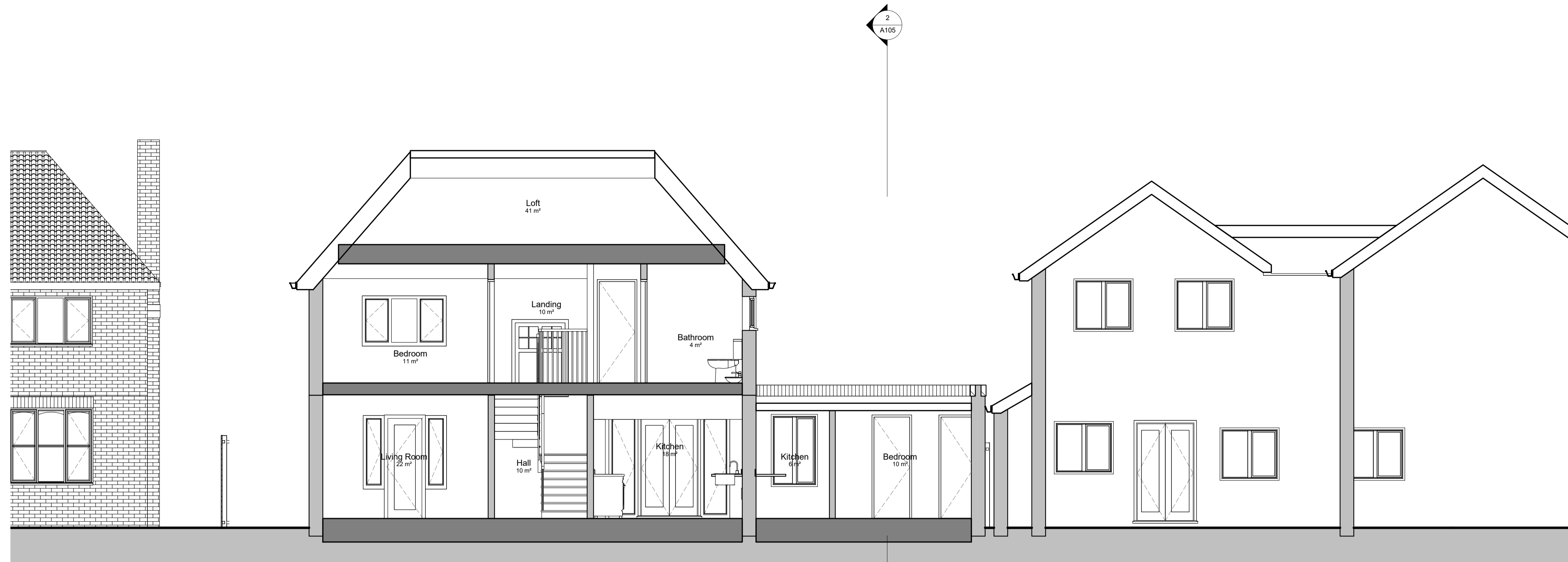
1 Existing Section A-A 1 : 50

General Notes This drawing is to be read in conjunction with all relevant design team specifications and drawings. All dimensions are to be checked on site prior to commencement of work any discrepancies reported to the Project Architect. All materials and components are to be handled, stored, protected, installed and finished strictly in accordance with the manufacturer's recommendations. Copyright RK Architectural Services Limited