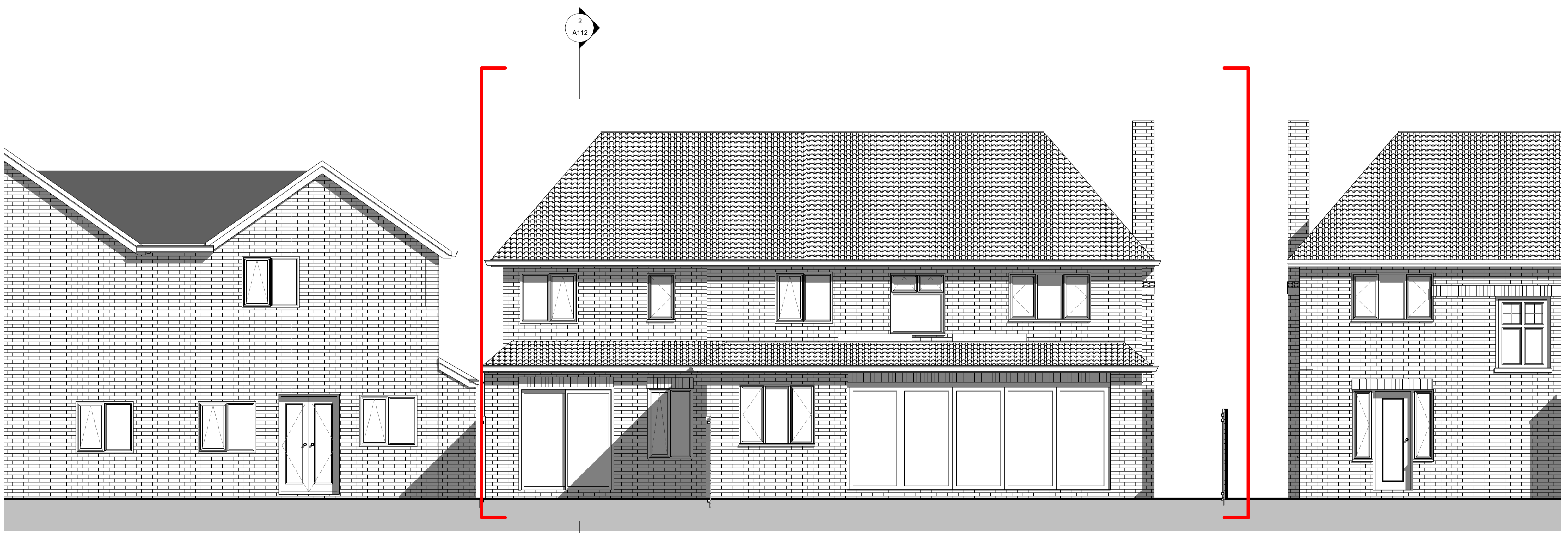
2 Proposed N-E Elevation 1:50