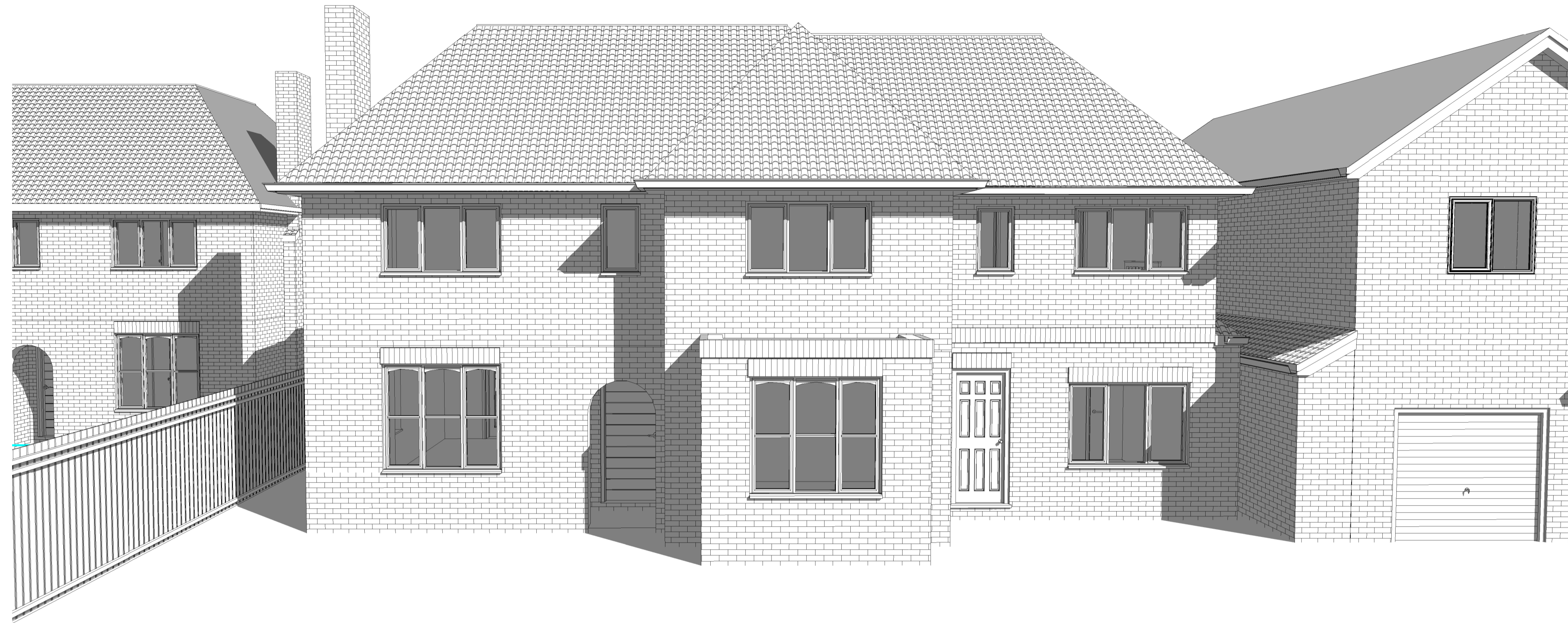
1 Proposed View 1

General Notes This drawing is to be read in conjunction with all relevant design team specifications and drawings. All dimensions are to be checked on site prior to commencement of work any discrepancies reported to the Project Architect. All materials and components are to be handled, stored, protected, installed and finished strictly in accordance with the manufacturer's recommendations. Copyright RK Architectural Services Limited