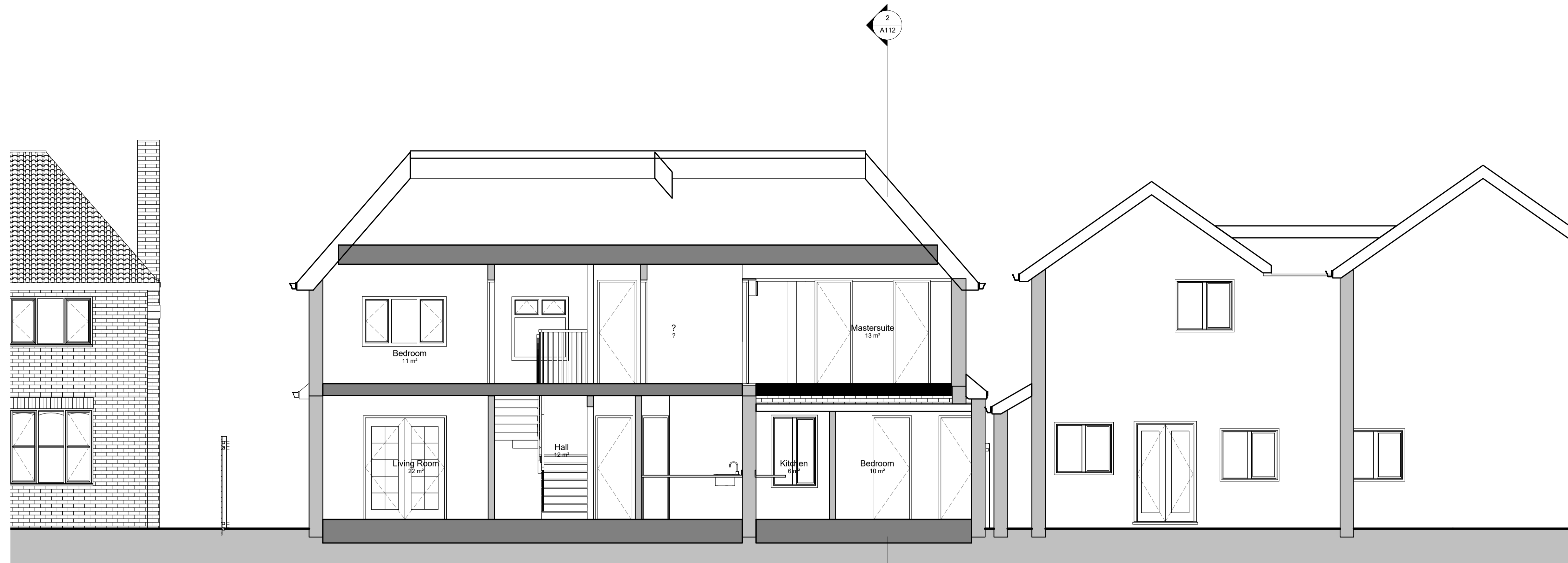
1 Proposed Section A-A 1 : 50

General Notes This drawing is to be read in conjunction with all relevant design team specifications and drawings. All dimensions are to be checked on site prior to commencement of work any discrepancies reported to the Project Architect. All materials and components are to be handled, stored, protected, installed and finished strictly in accordance with the manufacturer's recommendations. Copyright RK Architectural Services Limited